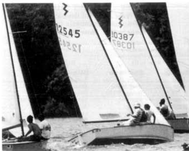
After the start with Fleet 270 at Indianapolis.