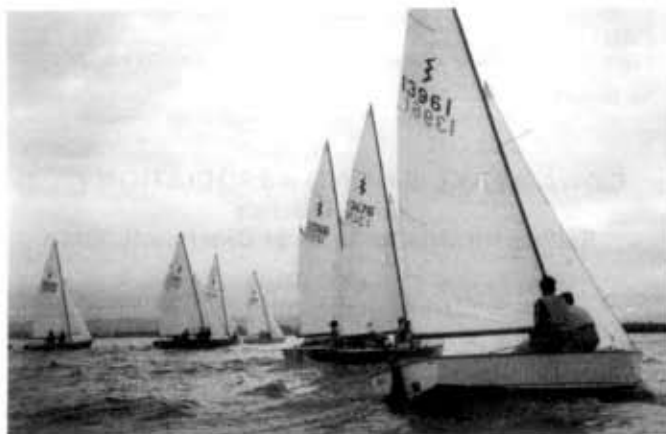
Heading for the weather mark on Vancouver Lake.

It's been a great year at VLSC and we hope next year will be even better. If you're planning to be in our area and want to participate in some fine racing, drop us a line. We have a good organization and would like to share it with you.