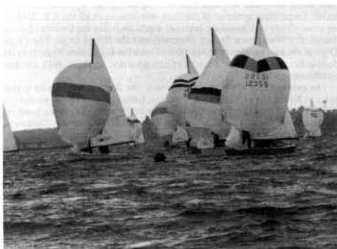
Great sailing with the Port Oswego Fleet.