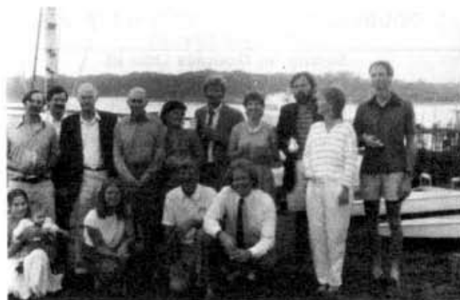
Fleet 431 silver winners gather by the Southampton Yacht Club flag pole during the awards cocktail party.

Rumors have it that we might see another new boat plus a few new skippers with boats at the starting line next year. COME; JOIN US.