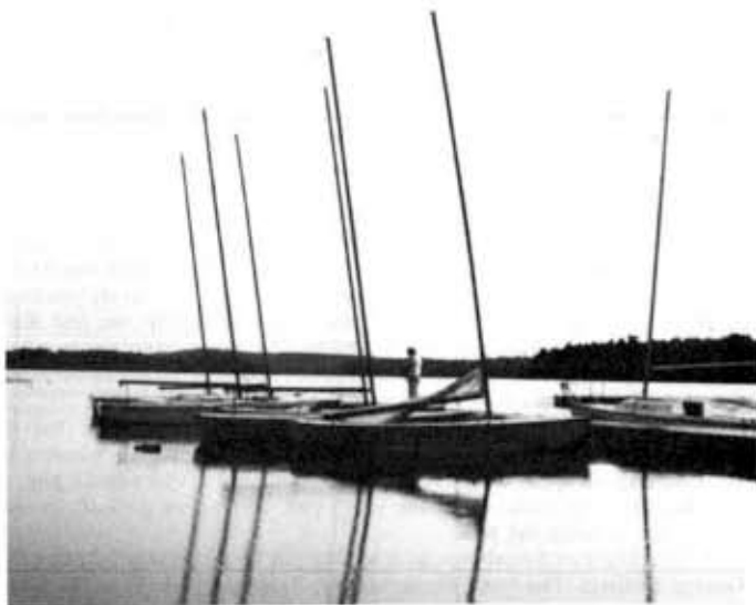
The Moods of Androscoggin