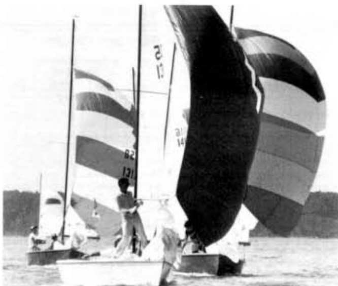
Close action in the Hernando DeSoto Regatta.