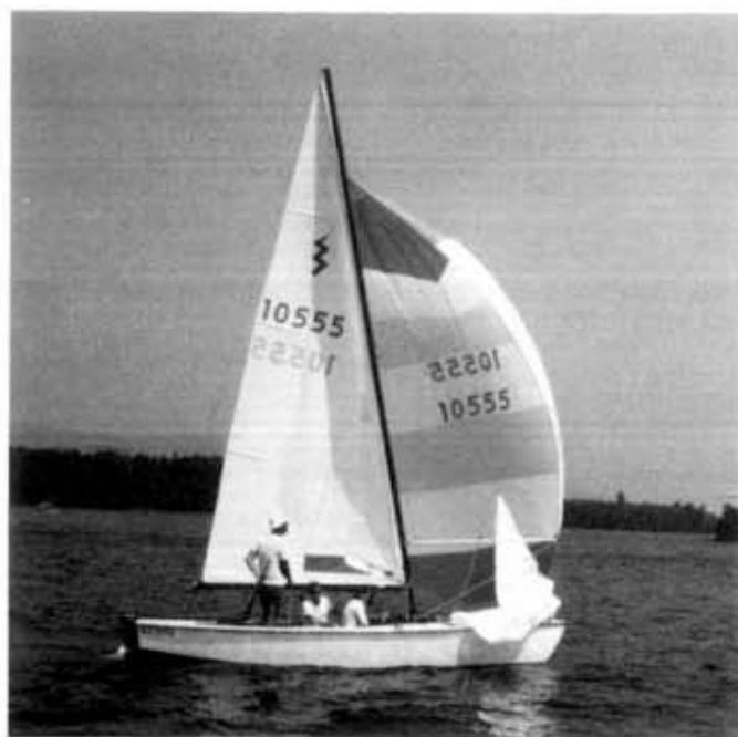
Central Atlantic District Sailing at Harvey Cedars, New Jersey