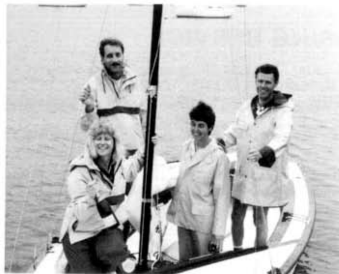
The Parkers and Treadwells — preparing for the maiden voyage of Treadwell's new Hendershore.