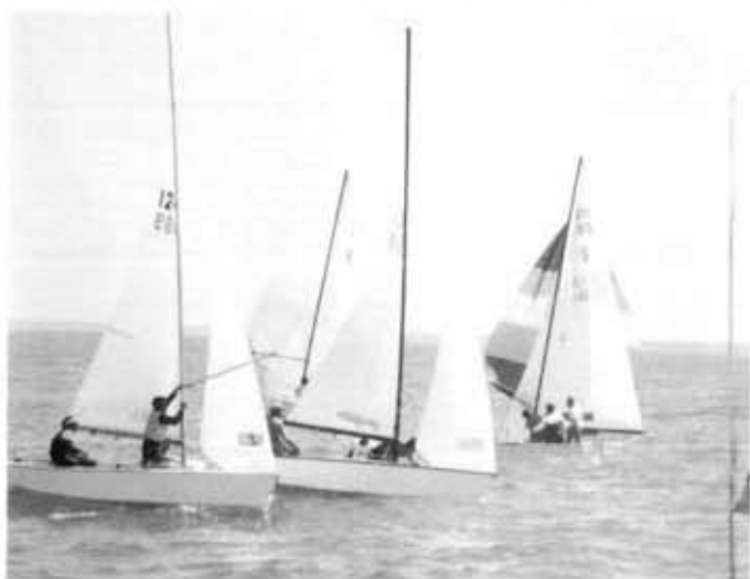
SIXTH RACE: Argentina 1st, US 2nd, Canada 3rd, Brazil 4th.