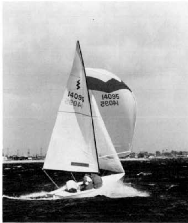
Scott Finkboner previews sailing off Mission Bay Yacht Club, site of 1988 North Americans.