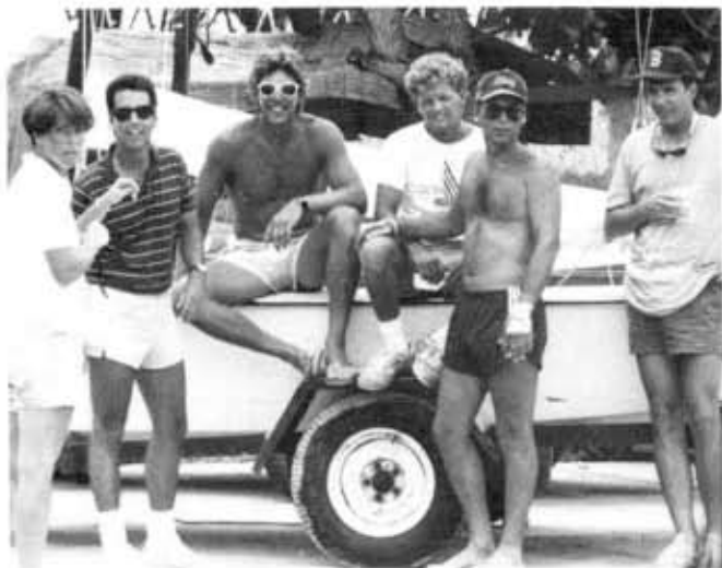
Relaxing after the race.