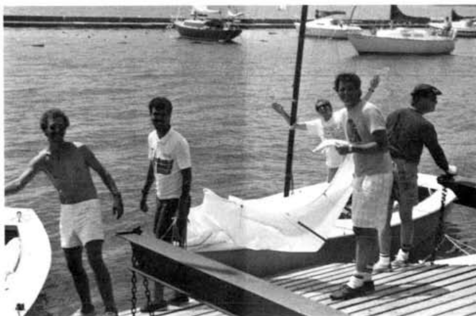
The long wait never changes from regatta to regatta. The price of dry sailing.