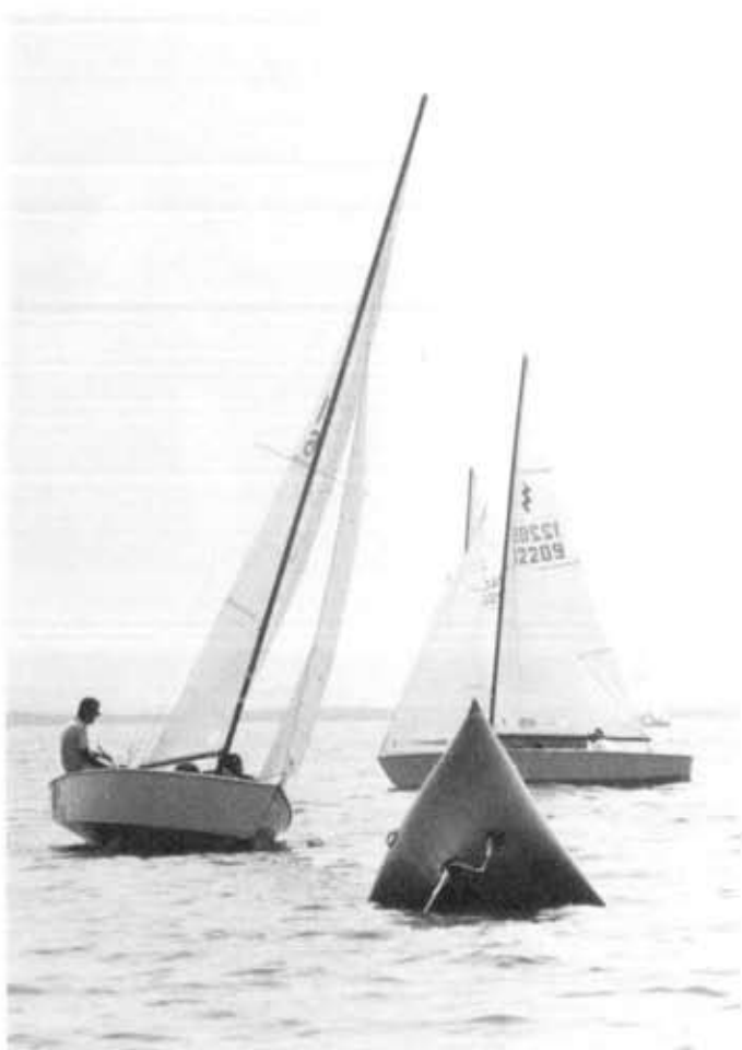
Central Atlantic Districts