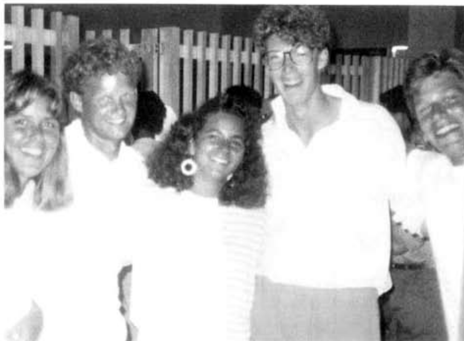
A Fun Group — Can you name them?