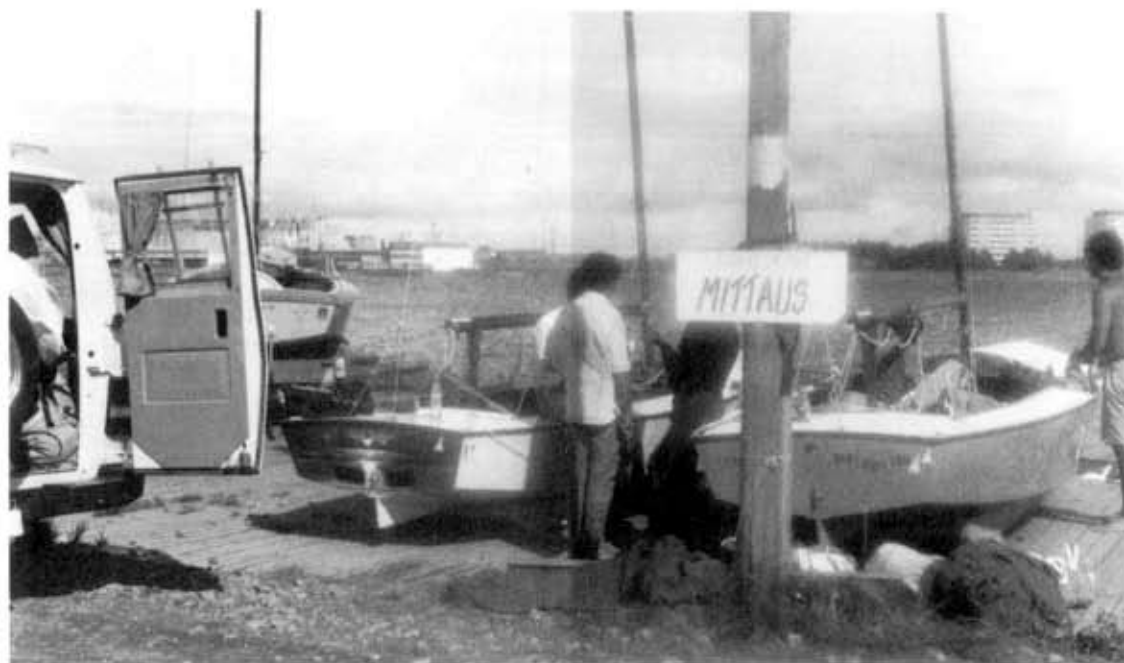
On shore at the Europeans.