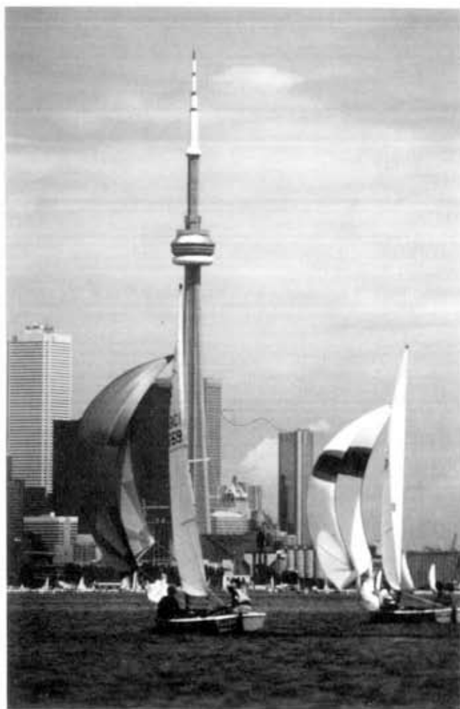
Beneath the CNN Tower, Toronto Canada.