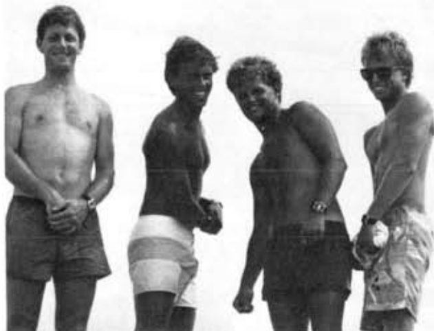
Showing those sailing muscles.