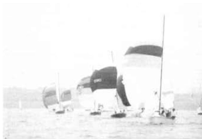
Action at Hernando DeSoto Regatta

Who says that smoking doesn't help in very light air?