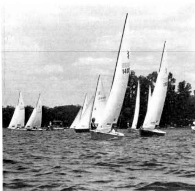
Starting line action in one of many Lansing Sailing Club's light air regattas.

The 1989 sailing season for the Lightning fleet of the Lansing Sailing Club will be remembered for the lack of wind. Courses were shortened, boats drifted, sailors baked. Often the most exciting part of a race day happened after the boats crossed the finish line and the crew could paddle. Our fleet leaders managed to capture air that no one else could find to finish ahead of the fleet.