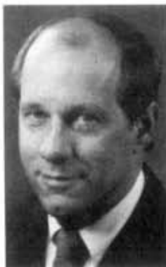
CHIEF MEASURER —