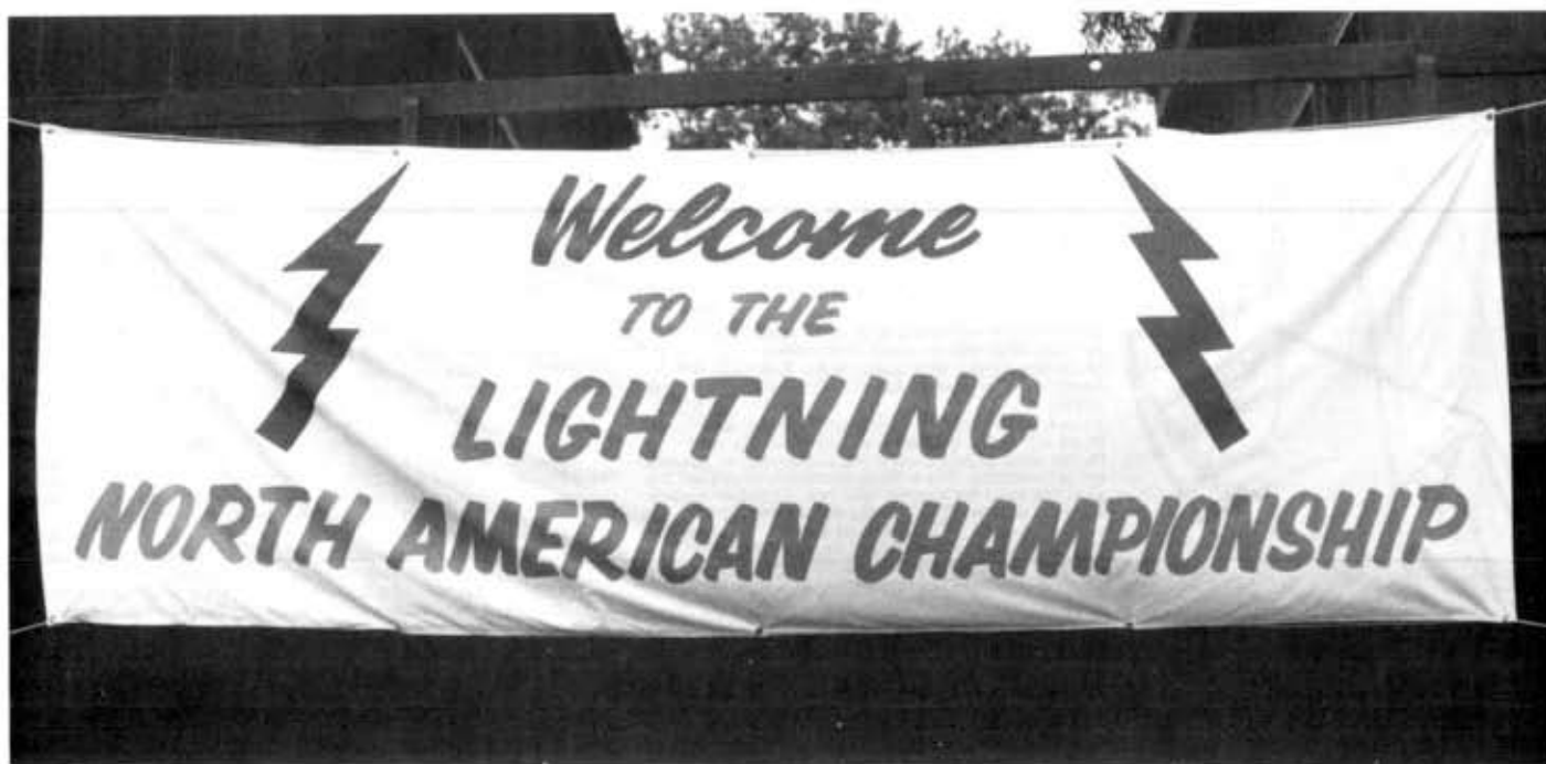
Rochester Yacht Club, hosted the North American, Presidents' Cup, and Governors' Cup and welcomed all in a big way.