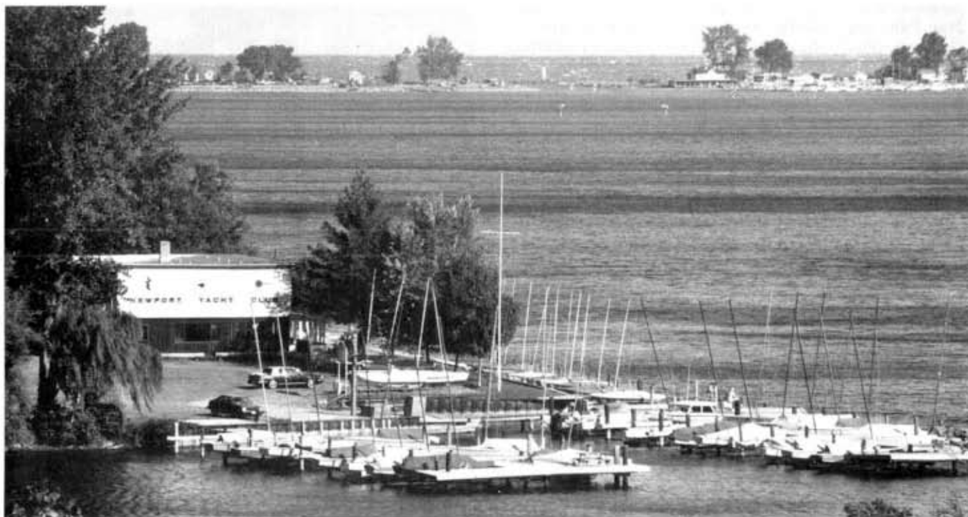
Newport Yacht Club, home of Fleet 77 hosted the Women, Junior, and Masters Championships.