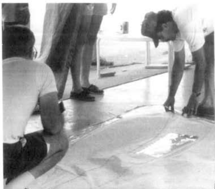
"Getting ready for the Competition".