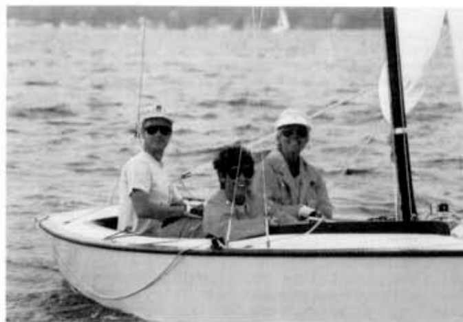
What you don't see is the water bucket — super soaker!

We are looking forward to an even greater year in 1993 at the South end of Saginaw Bay, see you there.