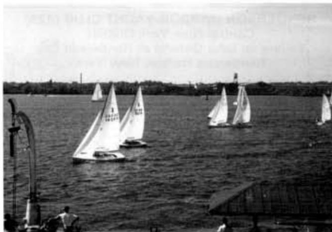
Fleet 228 had a good year of sailing on the Delaware River.

Come sail with us next year, where you're never too far ahead (or behind) if the tide is running.