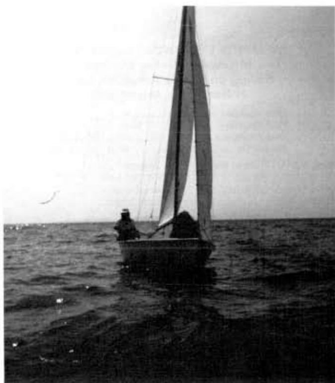
Temple Reef spirit on Lake Superior.