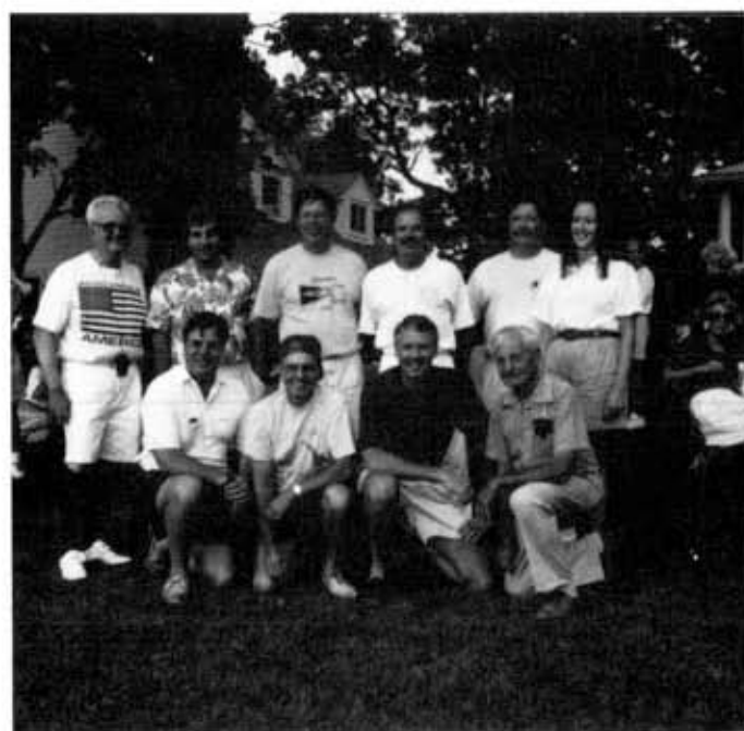
Some Fleet 180 sailors on the lawn.