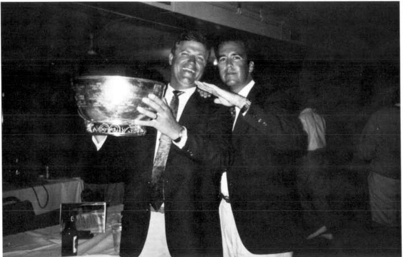
'91 Champ Passing the Trophy to '92 Champ

I hope to see you next year in Milwaukee!