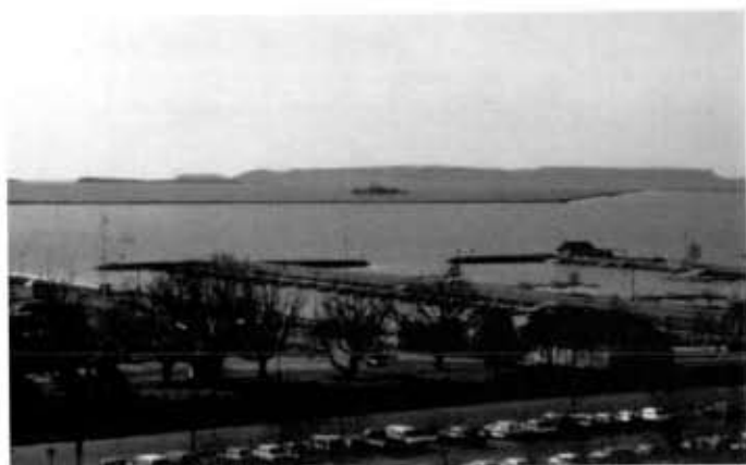
"The Best Sailing in Canada" "Clear Air, Clear Water" "Thunder Bay"

Good luck to all the Districts in 1994. Good Sailing!