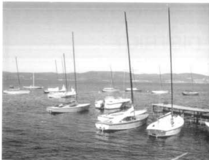
Lake Bracciano during the Italian Championships.