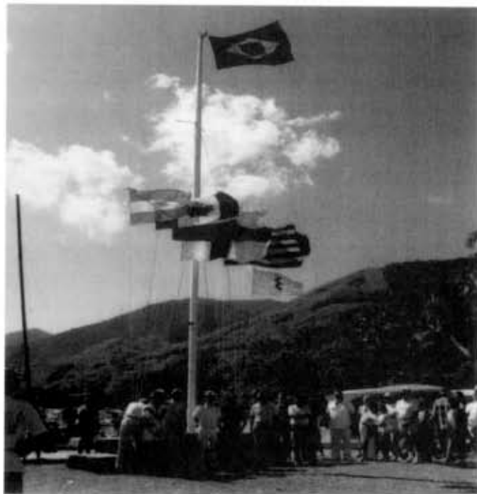
Opening ceremony at the World Championships.

We hope to see you all again in Finland.