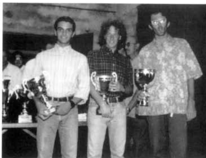
Well, the Italians know who they are. Sorry.