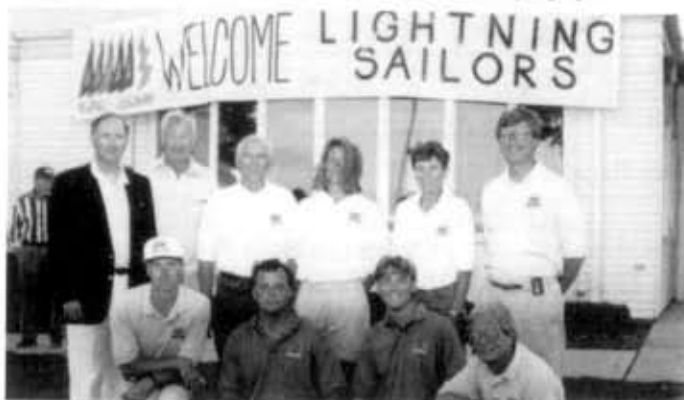
The Directors of the show and that "cast of thousands."