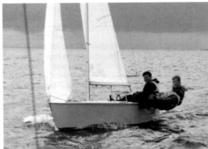
Masi V at the Finland Districts

Most of our regattas this year were sailed using other than the usual triangular Olympic courses. Both regattas at Lake Tuusulanjärvi were sailed with a short Hellerup course. Three of the ranking regattas were sailed with short courses. In Helsinki and Jyväskylä windward-leeward courses were used, and in Kuopio a short triangular and a slalom course were used. Some important experiences were that a short courses tend to become too hectic in heavy weather. The slalom course is too difficult even in light weather, because reaches are too short for proper spinnaker work. This course is definitely only for dinghies. A run after the first beat helps the last boats to catch the fleet, so the race is not only following the leading boat through the race area.