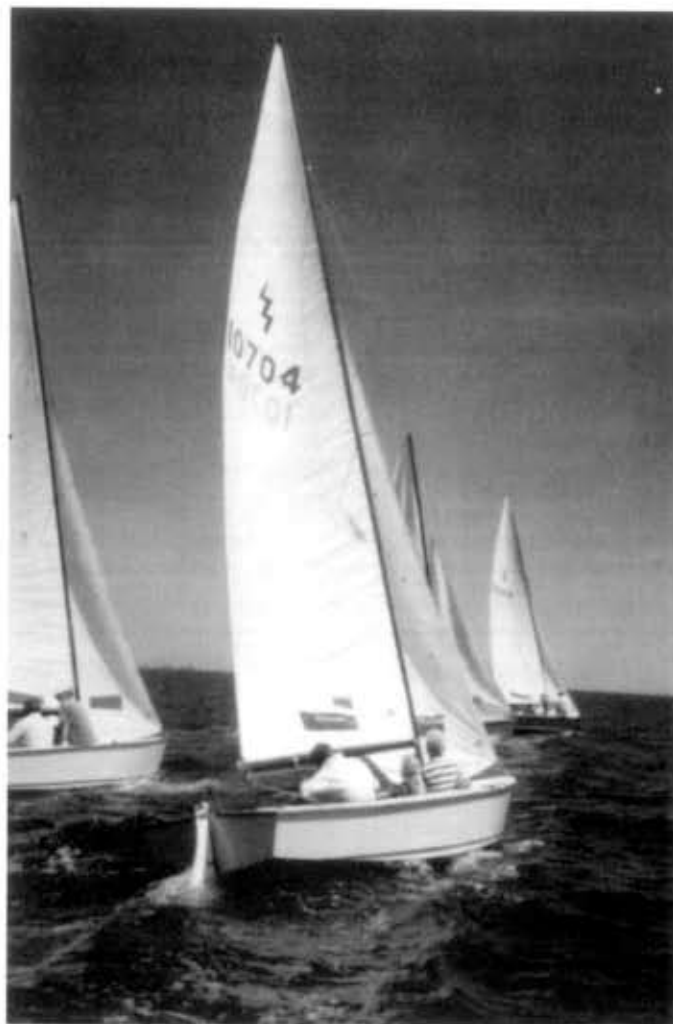
Start of a race - Madison Beach club.

Next year ought to be better yet with several people talking about getting new boats, and a wave of juniors ready to break out of the Blue Jays.