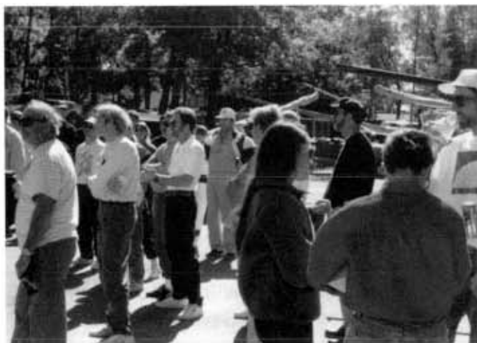
Sailors from Wisconsin, Illinois, Indiana, and New York, (that I can remember) as well as Michigan at the Gull Lake Regatta