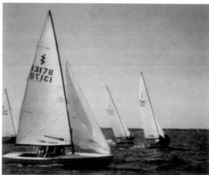
"Starting in a breezy westerly. Cold fronts were a typical occasion for our summer series this season."

The depth of our fleet has increased tremendously and I can't describe how rewarding and frustrating it is to be trailing the leaders in a race and still struggle just to maintain your position. We have much to offer to competitive Lightning racing, and will send a few entrants to compete in the 94' North American Championships in Toronto, Canada and should provide a strong contingent. We would like to invite others to compete with us in the 1994 season in any of our series or invitational regattas and look forward to a full and exciting new year.