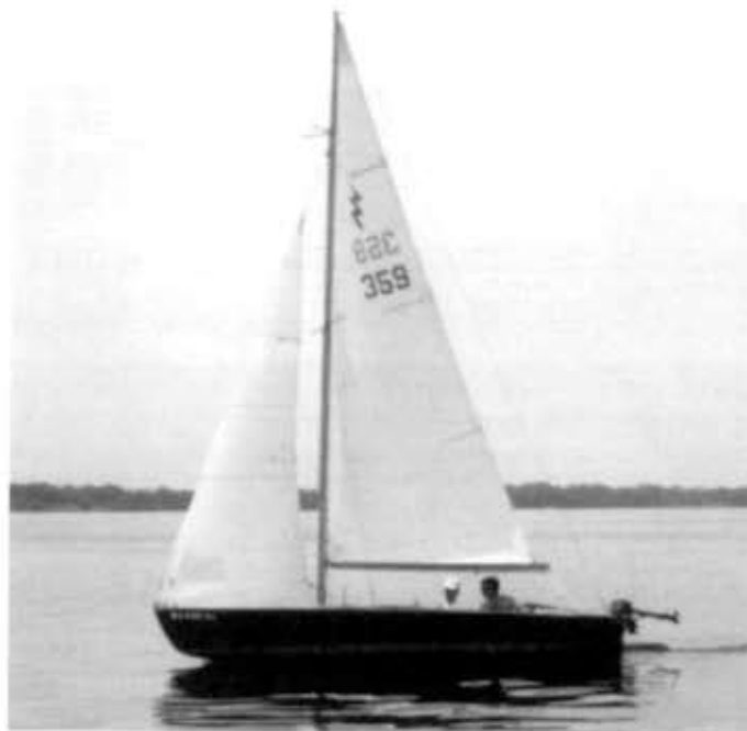
"Pete Chisholm in 359"

The annual weekend race/cruise to Oshkosh was attended by two Lightnings skippered by Sue Dorscheid and Tryg Jacobson. The light air race up the lake ended in a tie at Oshkosh. The sail home on Sunday was a wonderful 10 to 13 MPH breeze out of the south with shifts up to 30 degrees. Sue worked the oscillations perfectly and put Tryg away while he was looking for the big shift to the west. We are growing as a racing fleet, and are still trying to grow as a Lightning fleet. We remain, eternally optimistic.