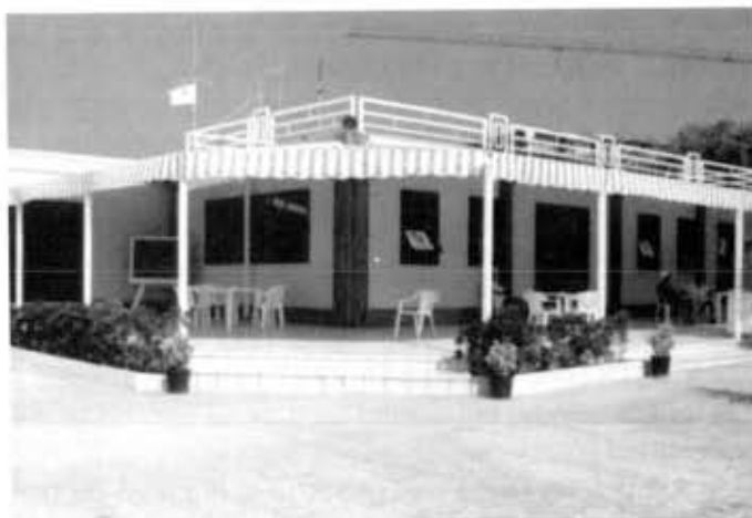
Circolo Velico Marsala, home of Fleet 449, hosts annually to the European Winter Championships, the Winter Criterium, during the last weekend in Dec.