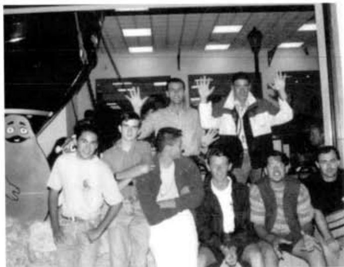
Some Fleet 449 sailors having a good time at the European Championships in Athens, Greece.