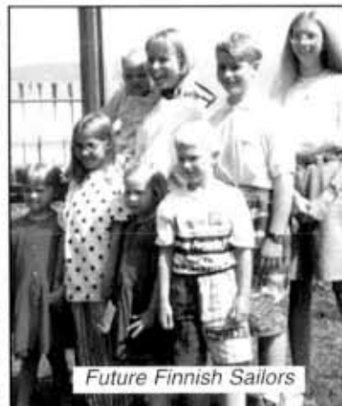
Future Finnish Sailors

All the Finnish skippers, some crew, and their children at the European Championship in Yverdon, Switzerland