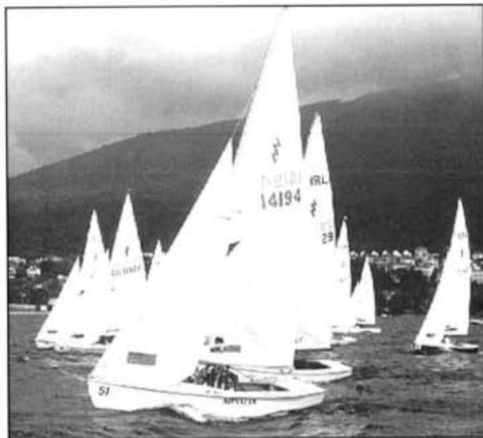
An exciting start for the boys from Northern Ireland in the World Youth Championships in Neuchâtel, Switzerland

The highlights of 1994 in our district were our fleet's 50th anniversary (front page, Oct.-Nov. Flashes ) and the opportunity for four of our young people to meet and compete against seventeen crews from ten nations on a beautiful mountain lake in French Switzerland.