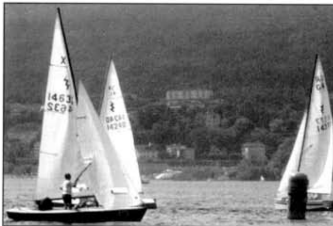
One of the Chilean boats, 14632, rounding the weather mark at the World Youth Championships.