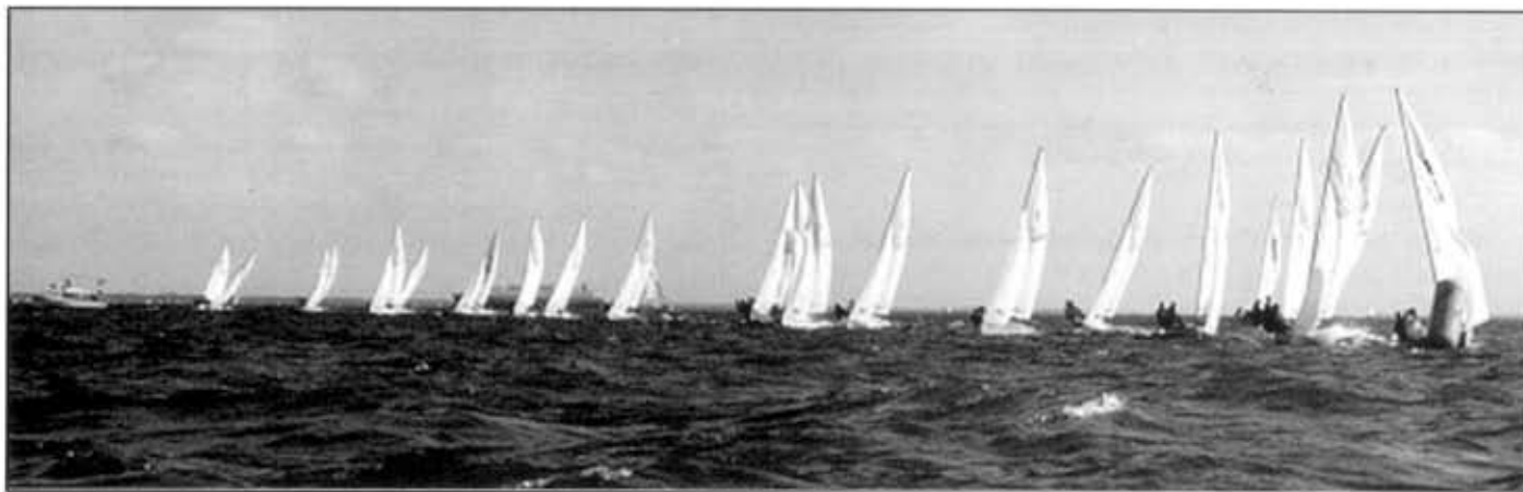
Top-notch race organizing and great conditions were typical at Dixie events this year.