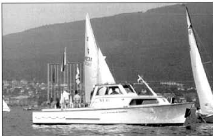
A Chilean, 14231, crossing the finish line in one of the races on Lac de Neuchâtel in Switzerland.