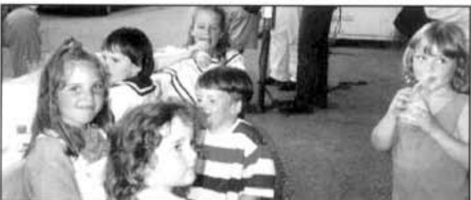
Here is the third generation. Will they sail Lightnings?