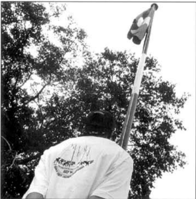
The second generation raising the Swiss flag at the World Youths.