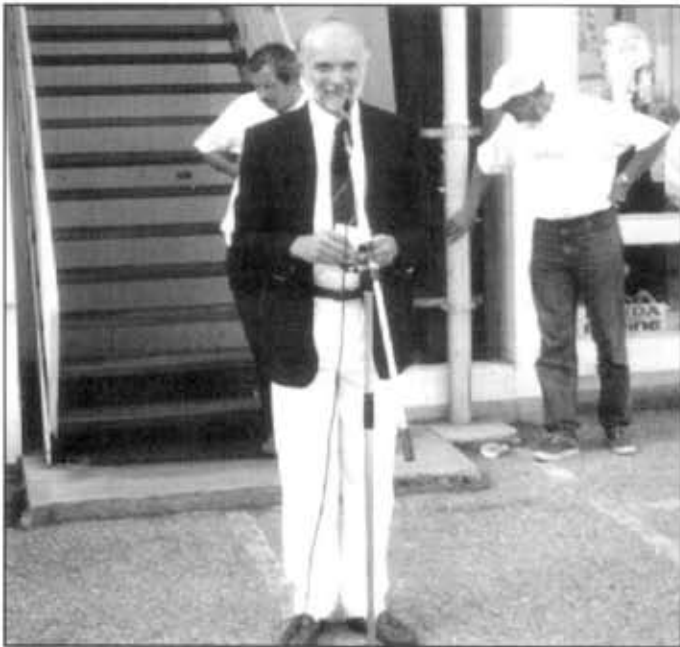
Commodore of the Swiss District - of the first generation of Lightning sailors in Switzerland