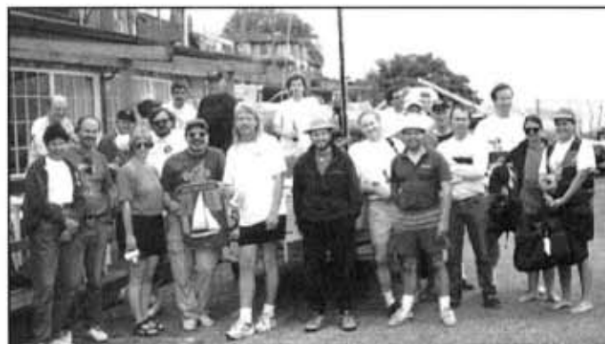
Prizegiving with some of the District participants.