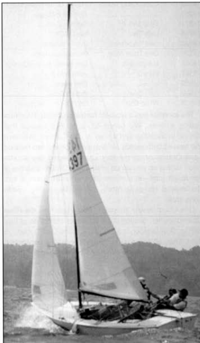
Skipper Chad Atkins on Irondequoit Bay - Fleet 77's NYC Invitational Regatta, August '94.