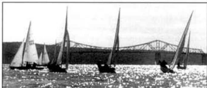
An example of the great sailing on the Hudson River.

Next year will prove to be one of our best seasons ever. Nyack Boat Club's Lightning Fleet 75 will celebrate its 50th anniversary in 1995. To honor this event we will host the Metropolitan Districts, the Atlantic Coast Championships and of course the Last Blast regatta. Our official anniversary celebration will take place on the weekend of July 29th and 30th. This celebration will take the form of a huge regatta incorporating the Magnus Pederson into the Atlantic Coasts. Please keep these regattas in mind, come enjoy some great sailing on the Hudson River and help us celebrate our 50th.