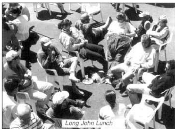
Long John Lunch