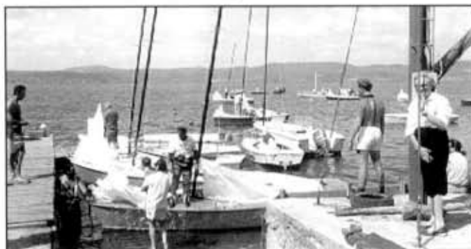
Putting in or taking out at Bracciano Lake