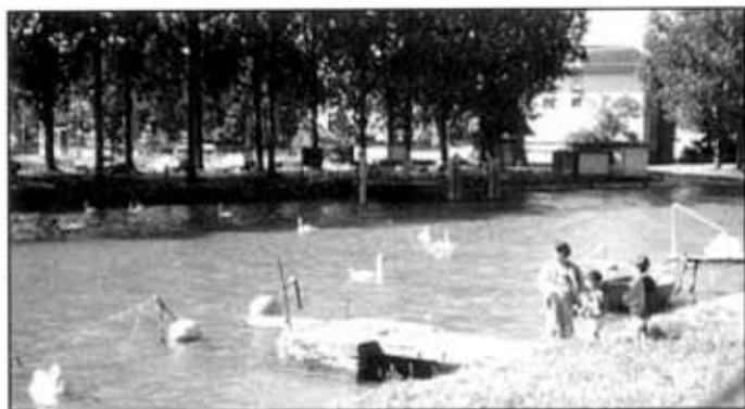
The future youth Italian crews are very interested in the swans on the river at Yverdon.

On the previous page is the newest boat being built by our excellent builder of boats that helps us to win so much.