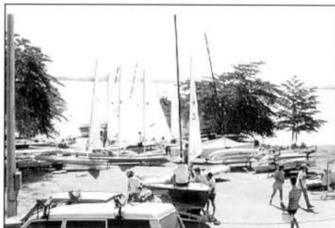
The marina at the Chongon Dam where Fleet 405 experienced lake sailing.

We expect a very active 1995 for Fleet 405, and hopefully an additional growth of at least three competitive boats.