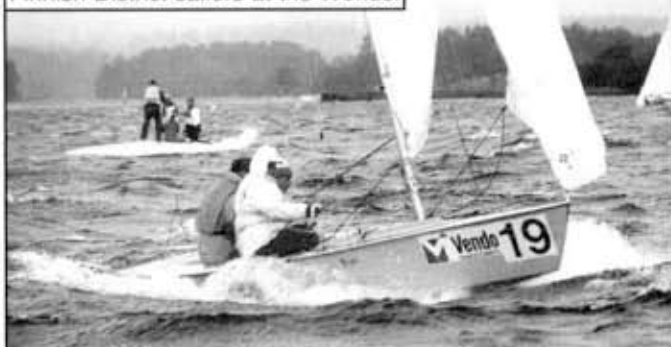
Finnish District sailors at the Worlds.

For up-to-date information about Lightnings in Finland, check out our Internet page: http://www.ncscst.fit-tma/lightning.html , - - - Timo Ahomäki