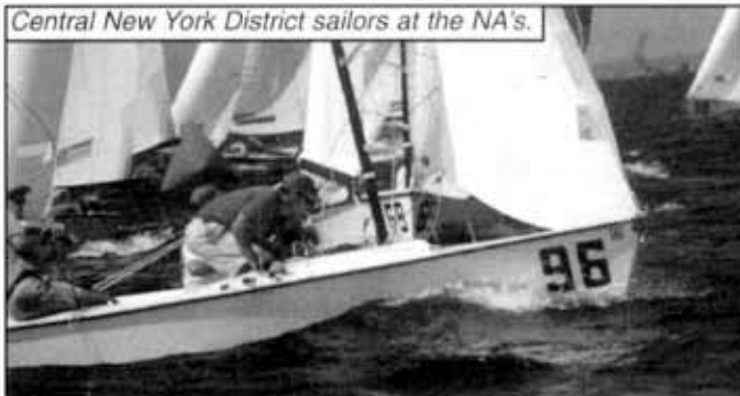
Central New York District sailors at the NA's.