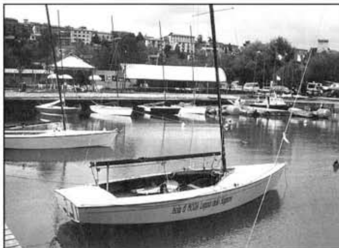
Circolo Velico Castiglione