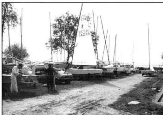
Setting up during measurement.