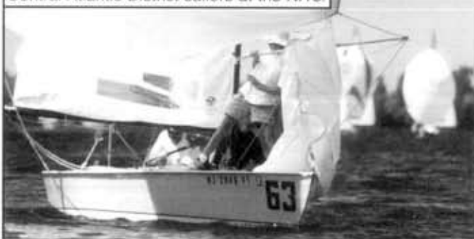
Central Atlantic District sailors at the NA's.