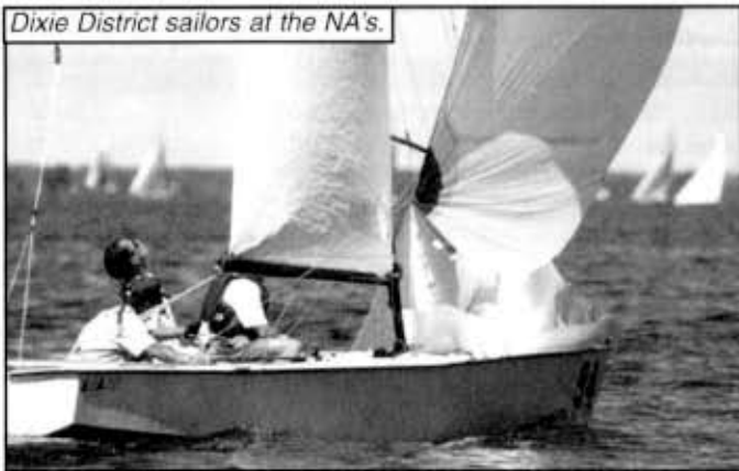
Dixie District sailors at the NA's.