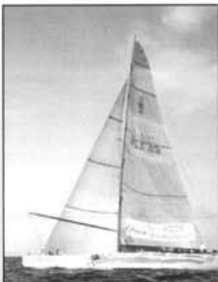
Mighty Mary at the mark.

Thursday there were three races on the ocean. It was a lay-day for Pact 95. They were out practicing and put a mark right by our course. Before the second windward leg of the first race there was a wind shift course change and half the fleet went for the Pact 95 mark before they realized their mistake. So that race was thrown out, which of course was good news/bad news.