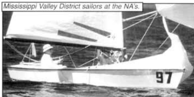
Mississippi Valley District sailors at the NA's.