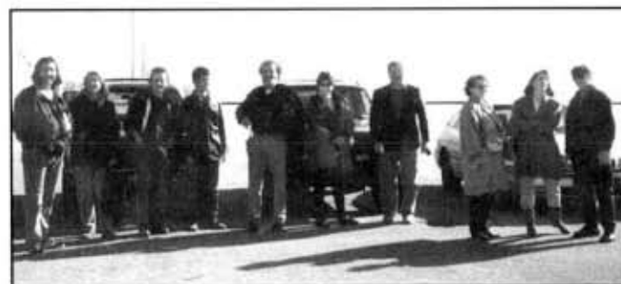
Swiss crews become more acquainted with Sicily-at a fishing harbor.