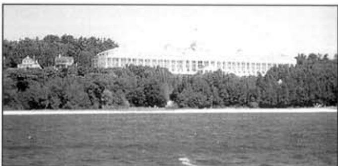
The famous Mackinac Island Hotel greets the Lightning sailors as they arrived for the 1st Annual Mackinac Island Regatta.