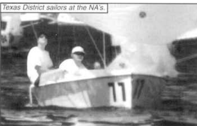
Texas District sailors at the NA's.