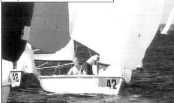
Metropolitan District sailors at the NA's.