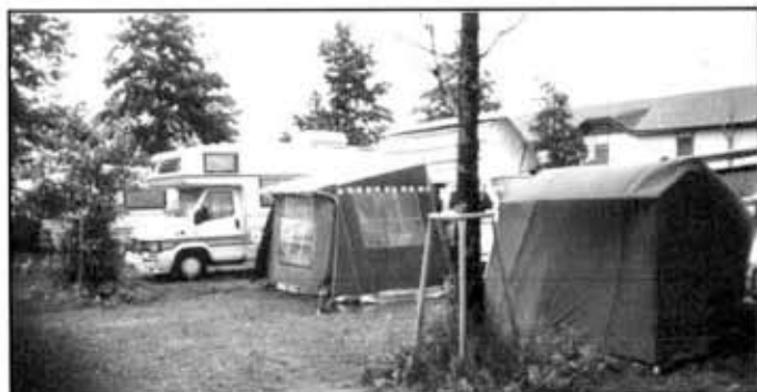
Two Swiss crews and families camp right at the harbor in Kuopio.