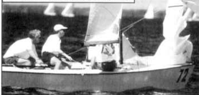
Southeastern District sailors at the NA's.