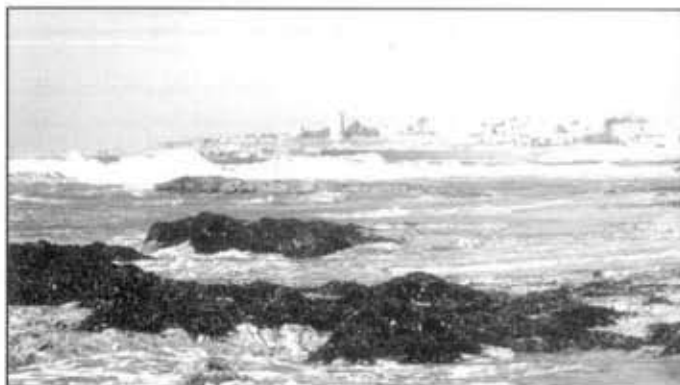
The coastline of "ancient" Sicily on the Mediterranean Sea.