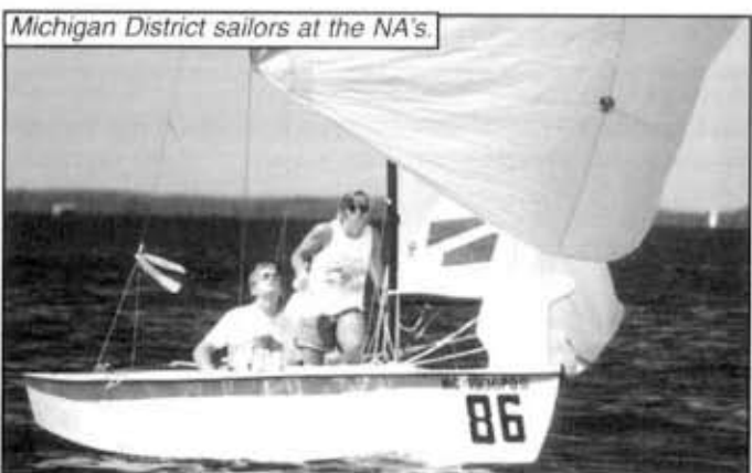
Michigan District sailors at the NA's.