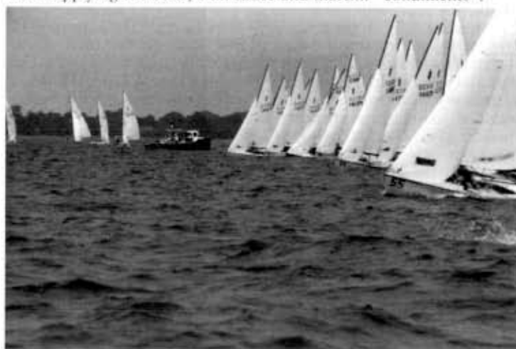
Crowded start at the 1997 North American Championships at CSYC