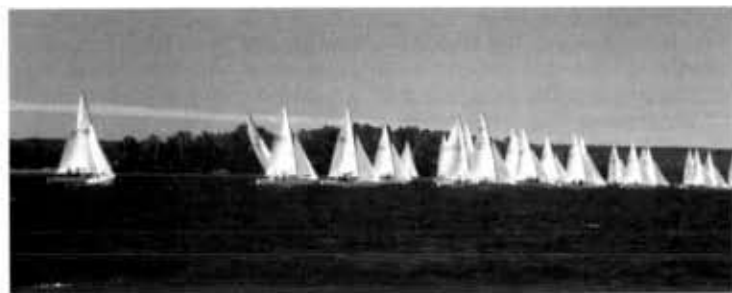
Michigan District Championship action at Higgins Lake