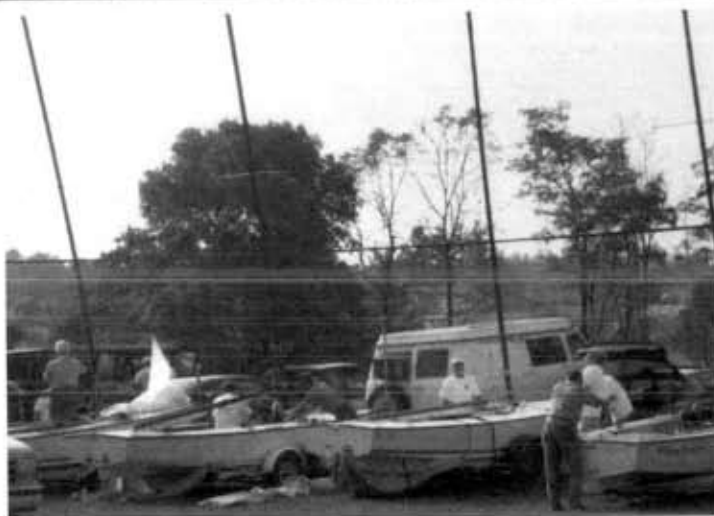
Fleet 150's Bare Bones Regatta: sailing/packing up