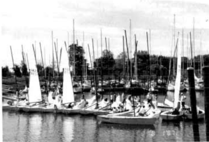
Cedar Point Yacht Club A great place for Lightnings!