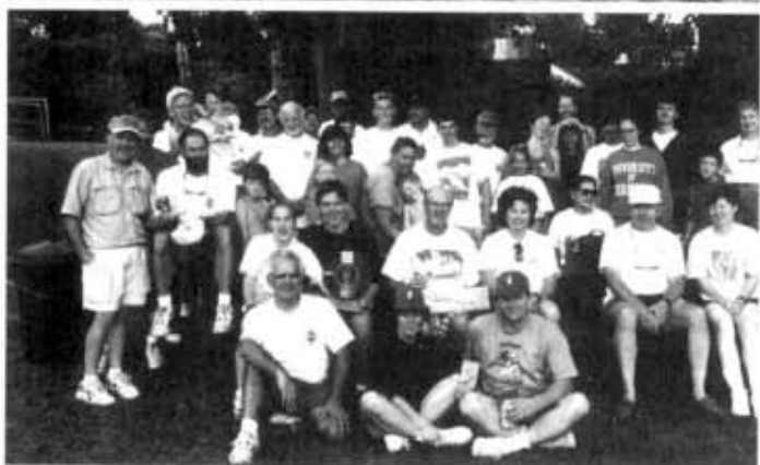
Fleet 164's Caz Flash Bash: Fun on and off the water