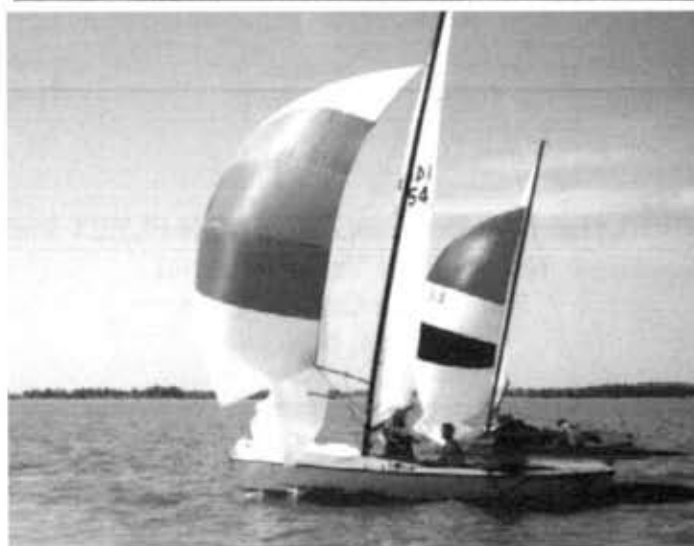
Sailing at Fleet 266's Mid-Continent Regatta