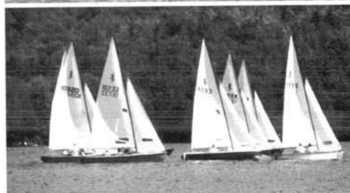
Sailing on Squam FLake, home of Fleet 332.