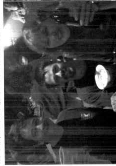
Team Smokler enjoys the party