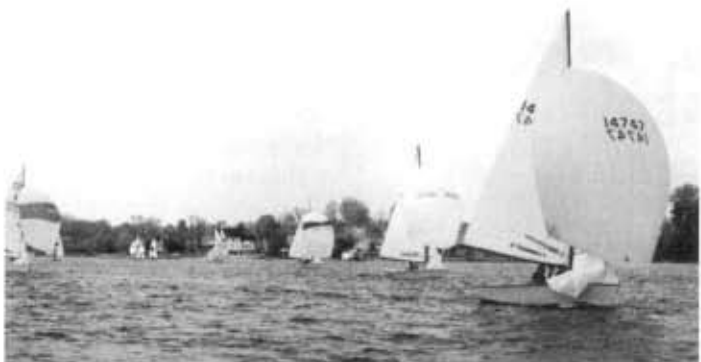
Indy Open sailing on Geist Reservoir, home of Fleet 270.