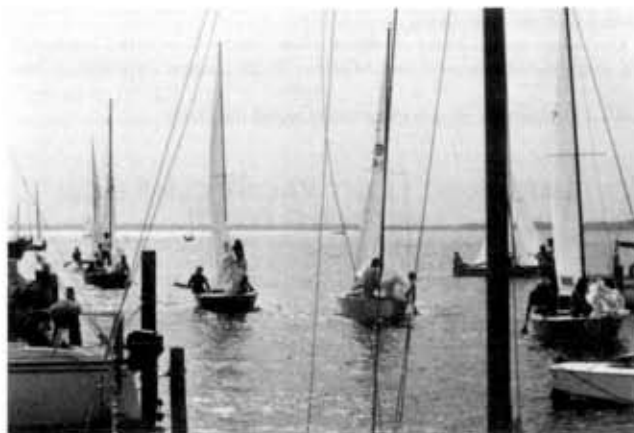
The Rehoboth Fleet returns from another day.