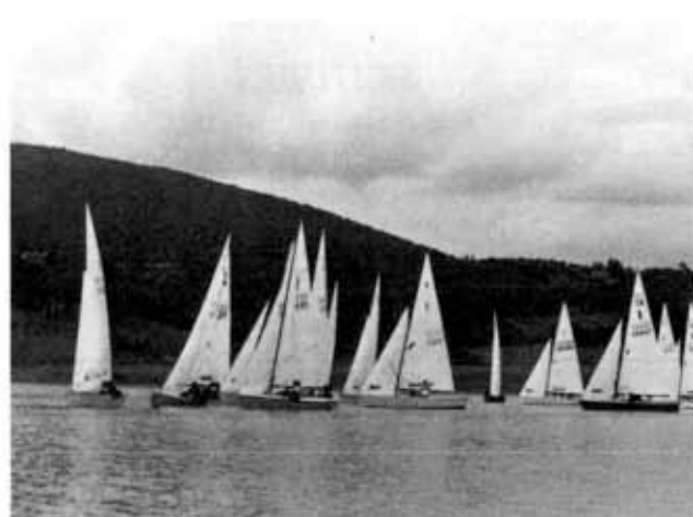
Notice the wind in the Nationals.