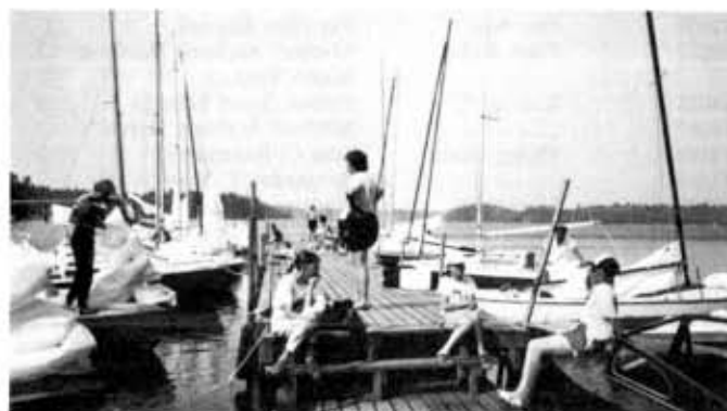
A great racing atmosphere is shared by Valkeakoski Fleet 468 and visitors.