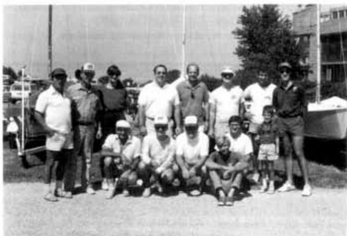
Fleet 435 preparing for a race!