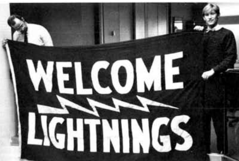
The authentic 1939 banner is examined by Fleet 332 research team. Carbon 14 dating is a possibility if funds can be raised.