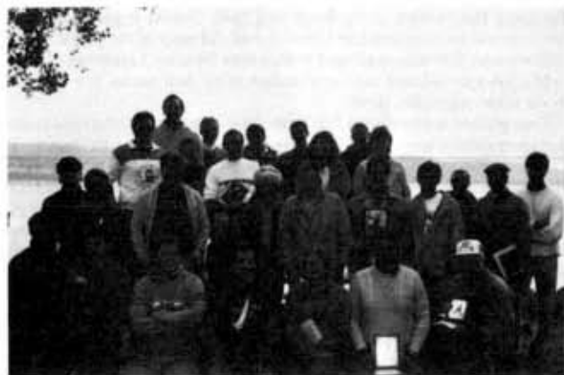
5th Annual Muddy Rudder Regatta.

From the Indiana Open to the Bluenose, this 1988 season brought many new experiences and friends. Let's continue a great class act in the 51st year.