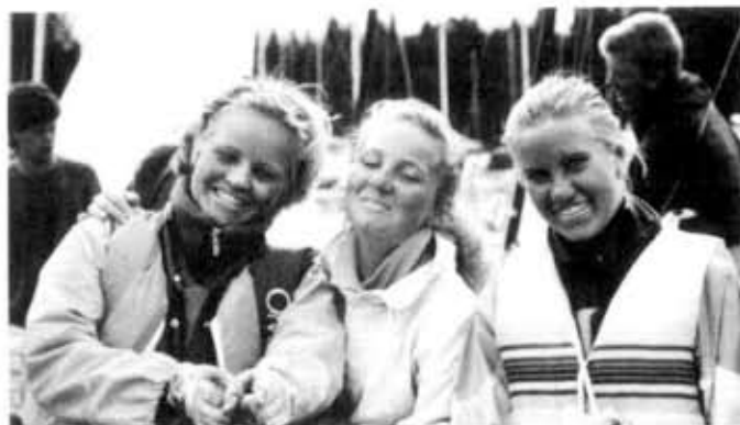
Fleet 456 at the '88 World Youth Championship — the Bumble-Bee team ready to take off.

On the Rocks Regatta opened our sailing season '88 as traditionally in early May, just a couple of weeks after ice was melted away on our Lake. Eleven Lightnings sailed in light winds and eagerly waited for District, European and Youth Worlds Championships among many other exciting races this year in Finland.