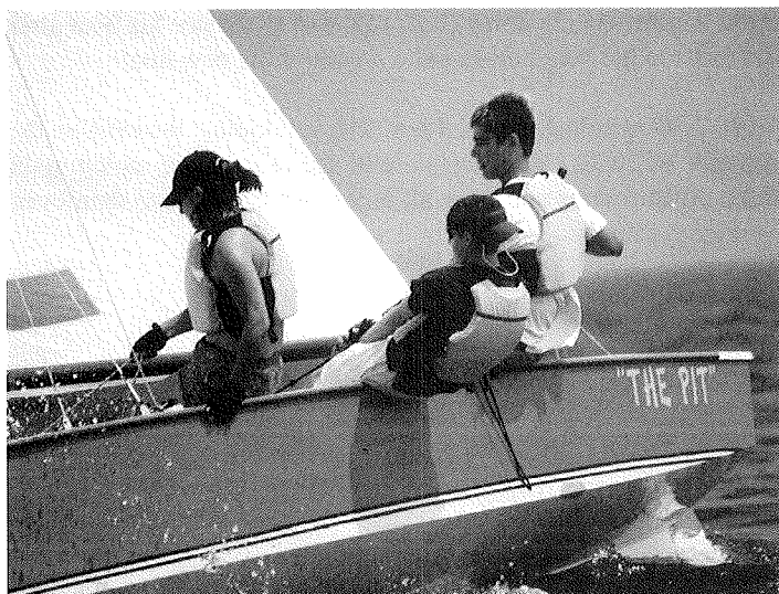
1999 Junior Champion Team from Henderson Harbor Fleet #225