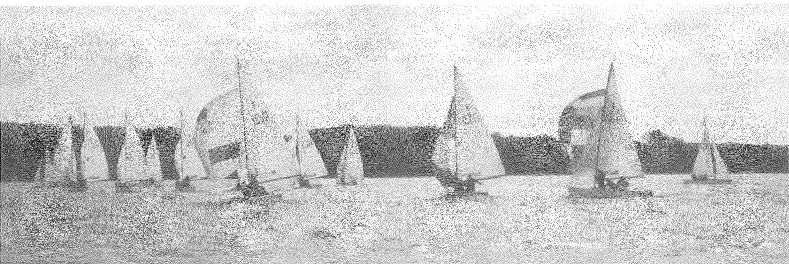
39 boats on the course at the Spring Classic.