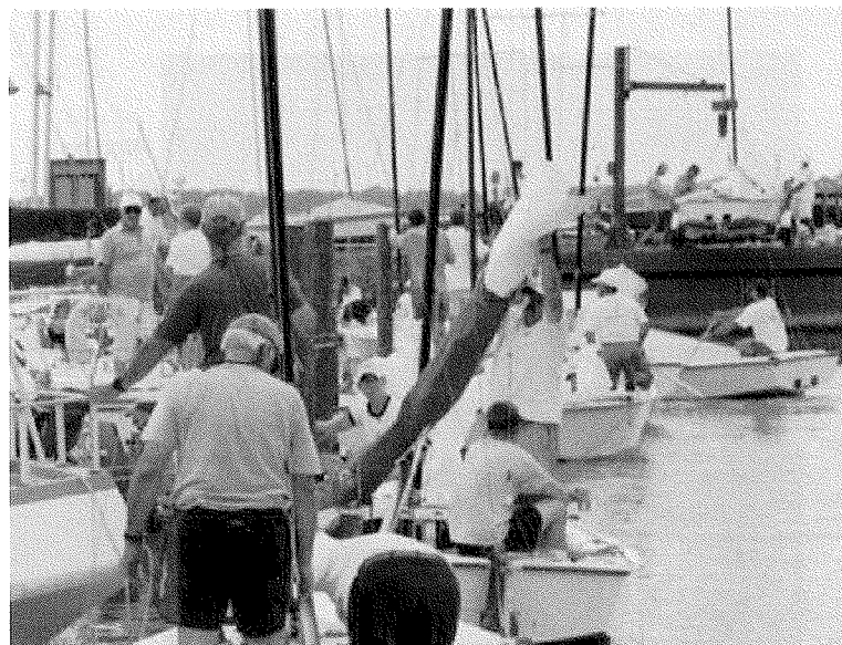
Shots from the Onondaga One Day Regatta.