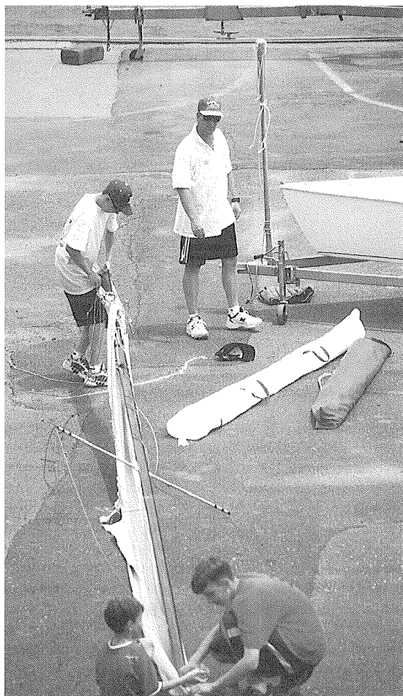
Rigging at North Shrews- bury, Fleet 11