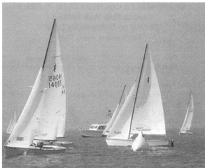
Fleet 5 experiments with Chicago's ghost payrollers to get more boats on the line.