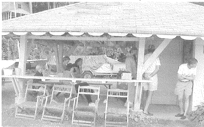
Waiting for the wind to come up and the rain to stop at Lake Mohawk Yacht Club.