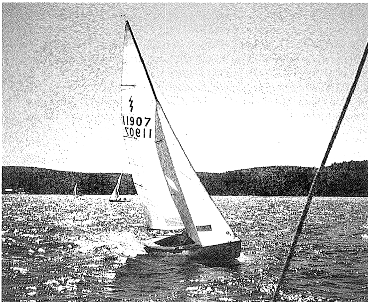
Finish line at PA Governor's Cup