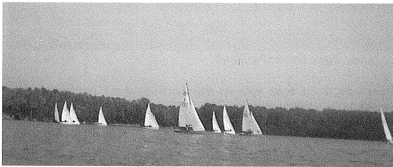
A calm but beautiful day of racing at Leatherlips