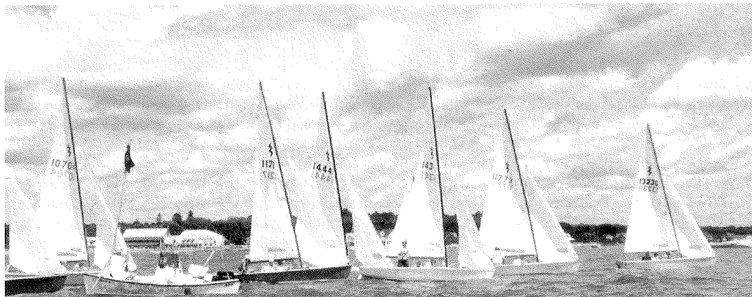
Racing out of the Madison Beach Club