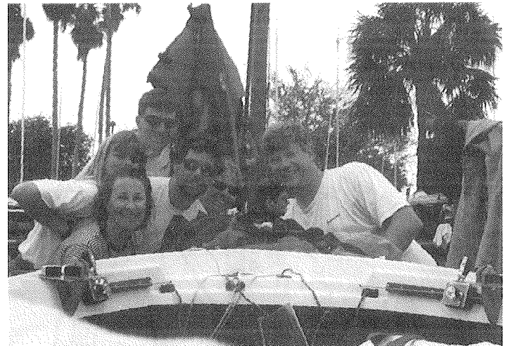
Fleet #301 at the Southern Circuit.

The Leaf Peeper Regatta is always a highlight of the year for Fleet 301. October is a spectacular month in Vermont as the winds are usually strong and the maple leaves are brilliant colors. This year however, winter was making a early showing with snow and freezing rain in the forecast the week before the regatta. As luck would have it, we had a beautiful weekend complete with thrills, spills and chills.