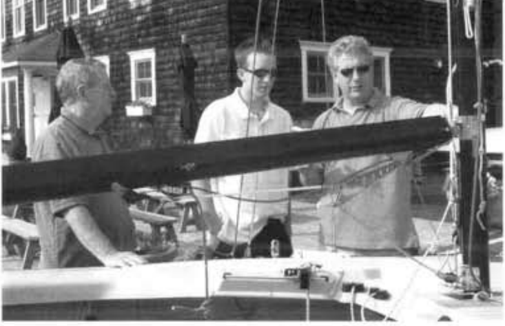
The Huntsman men tune.