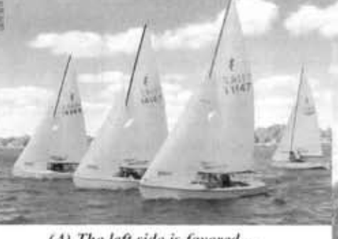
(A) The left side is favored ....