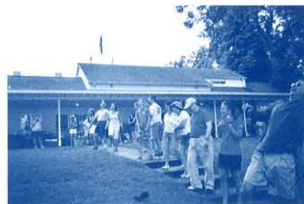
Must be a Midwest thing... shoe flipping at July 4th picnic