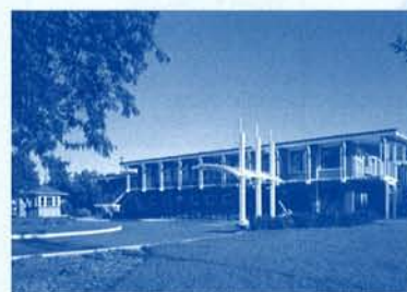
The renovated MYC clubhouse.