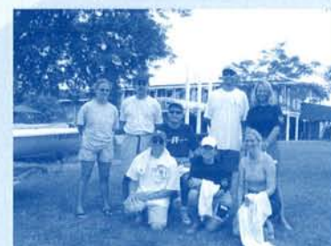
The P&T winners!