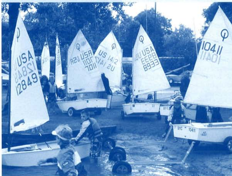
Future Lightning sailors invade PYC

Other PYC events of note included a spring Open House, a Back of the Fleet Help day, and a visit from Skip Dieball of North Sails to provide some pre-race tuning advice and post-race critiquing.