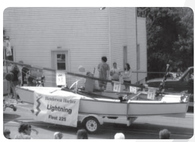
Capt' "Hook" Treadwell's Lightning in parade