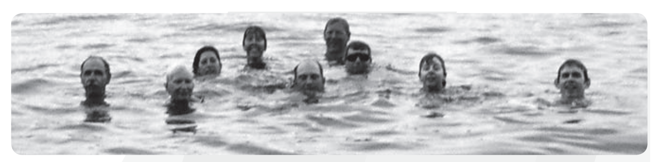
Ithaca Fleet members swimming in the warm Lake!

District fleets the end of July. We got lucky with the wind goddess for those two days and held 5 races. Everyone had a fun time that weekend since it was "Pirates Night" at the yacht club and guests could camp out on the beautiful point.