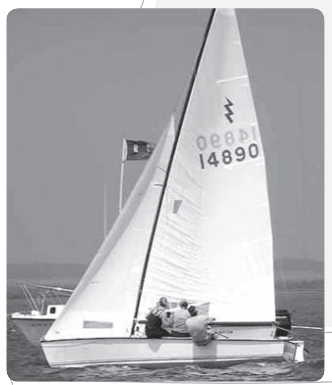
BBYC Lightening Finish

The Delaware River was busy again this year with more than 20 races of 8+ Lightnings each Wednesday night. We raced along side four other fleets with up to 80 boats in total on the river making for some very interesting mark roundings. Afterwards everyone gathered around the newly