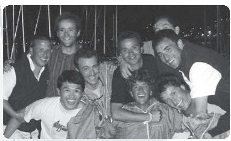
Brazilian competitors at the World Championship in Chile

Sailing on Guanabara Bay Rio de Janeiro, Brazil Brazil District