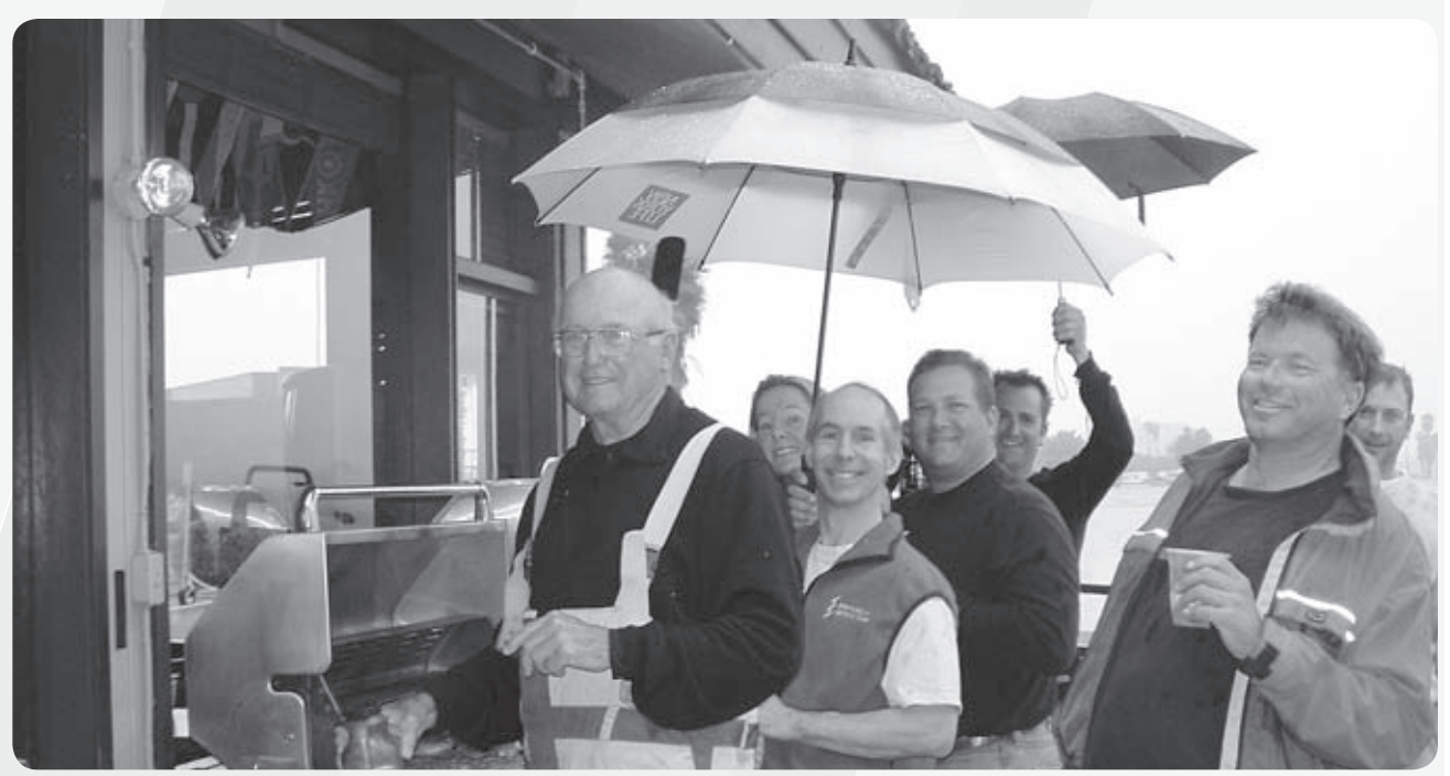
Cookout in the rain!

Five Lightnings from San Diego traveled to San Francisco for the Pacific Coast Championships in September. Much to the fleet's chagrin, none of