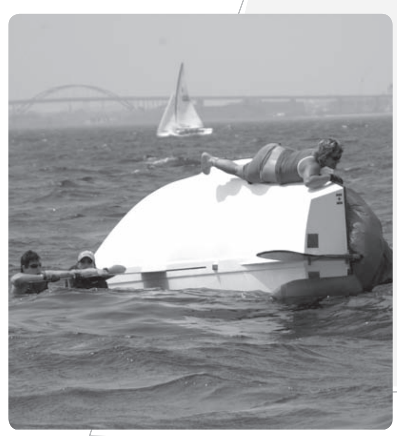
Canadian Women: The Thunder Bay, Ontario women's team enjoying the warm water!

Of course, the people with the biggest smiles were the winners.