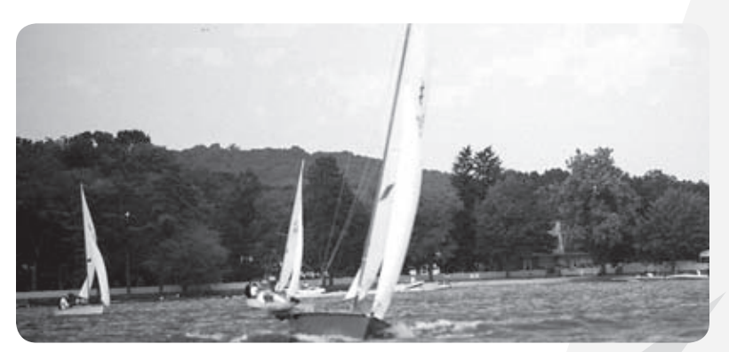
Fleet Champion Rich Miner in the lead

August 28th brought little wind and increasing rain, but two Lightnings, skippered by Chuck Chute and Calvin Hopkins respectively, raced head-tohead. Chuck's crew, Dave Newton, summed things up in commenting that at times he felt as though the rain hitting the sails was propelling them more than the wind. Nonetheless, they managed two races and each boat captured one first place position for the day.