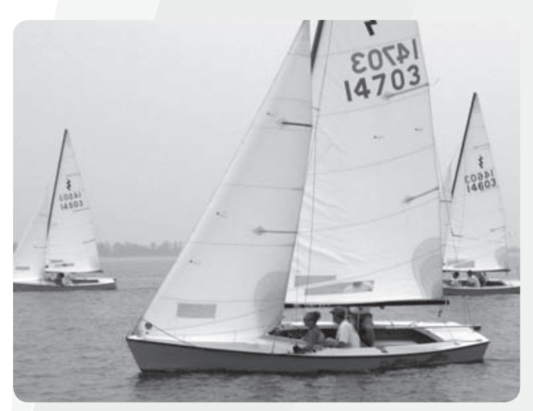
Battle of the 03s