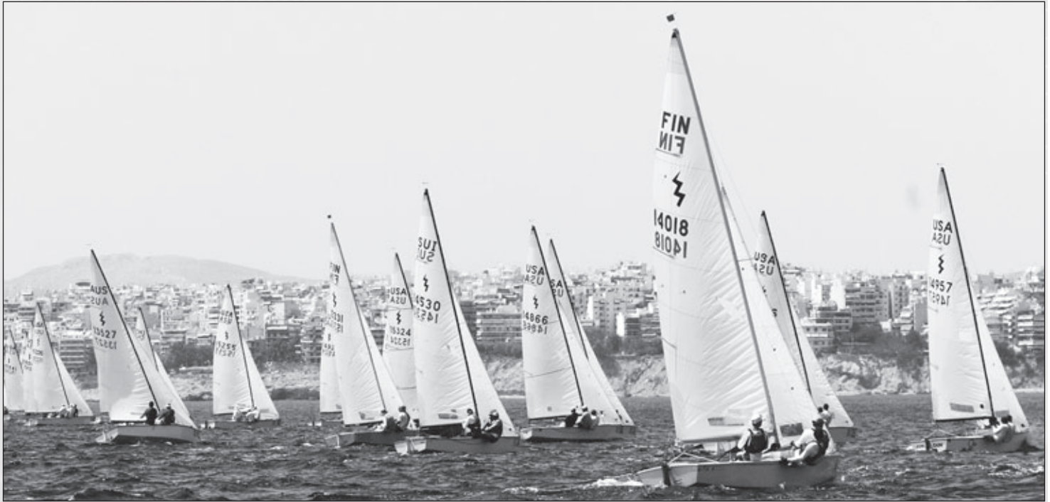
Linton Team leading at the Worlds