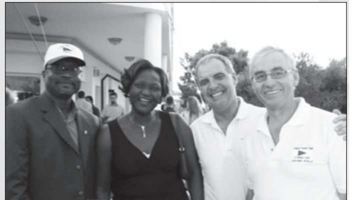
Nigerian ambassador to Greece meeting members of the Lagos Yacht Club