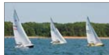
Fleet Racing at WCSC