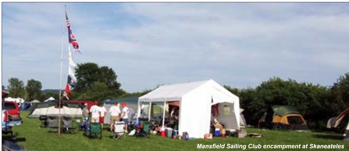
Mansfield Sailing Club encampment at Skaneateles

deal of time to the club's facilities. He loved sailing Lightnings and Mansfield Sailing Club. We will all miss him very much.