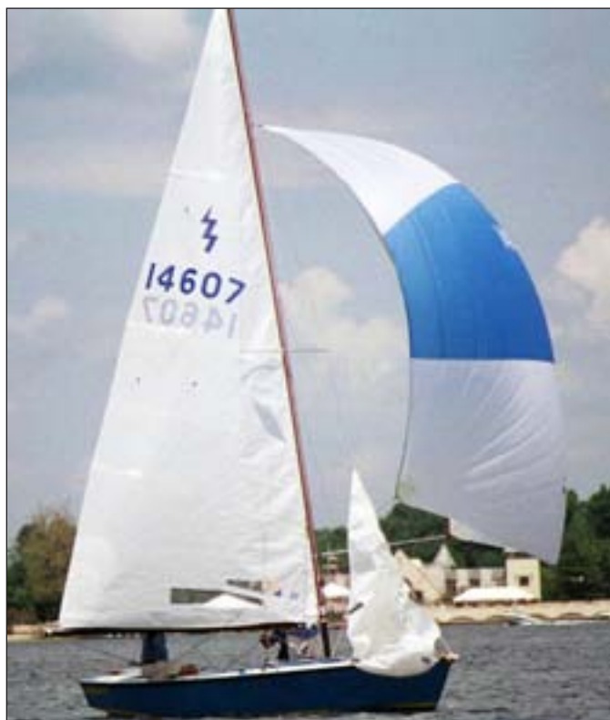
Fleet Champion Rich Miner