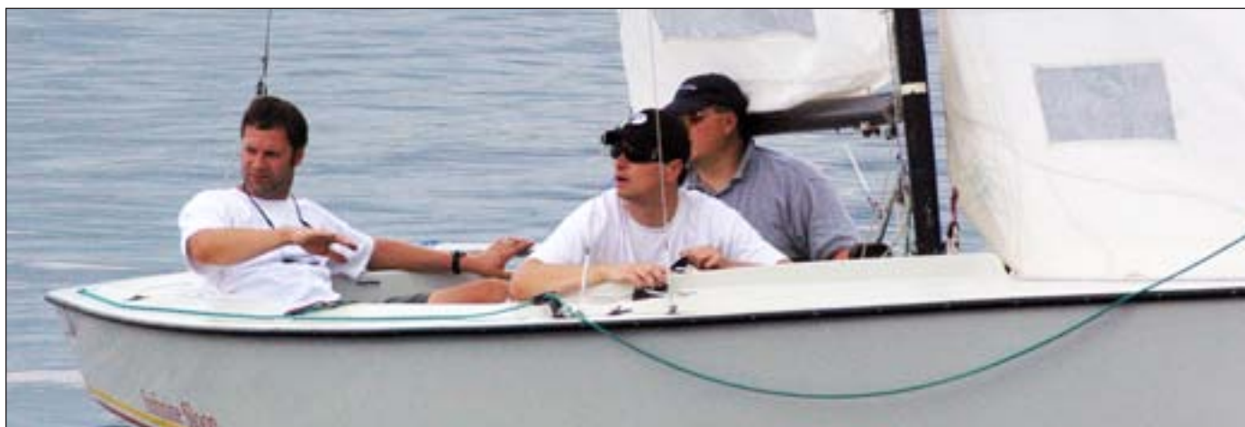
Infinite Sloop incredulous at the competition