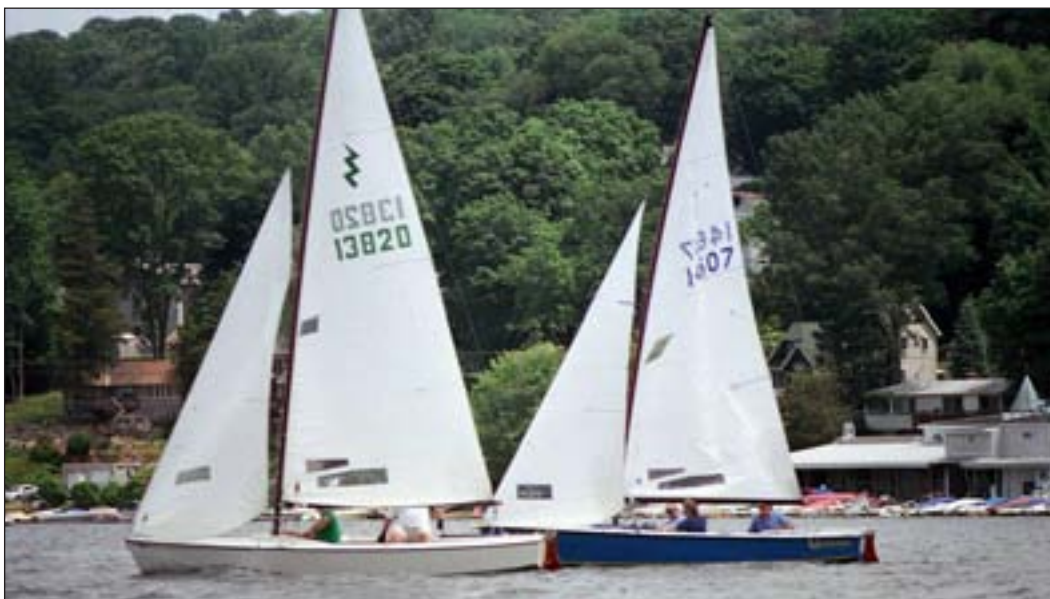
Chuck Chute edges ahead of Rich Miner

On June 1 regular racing resumed with winds that built to over 15 knots. Only one race was held, with Perry Anderson holding first place for the Spring Series. The tides changed the following week when, on June 8 in a steady and strong wind out of the southwest, Chuck Chute captured two firsts.