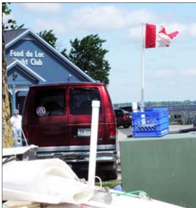
Plenty of breeze