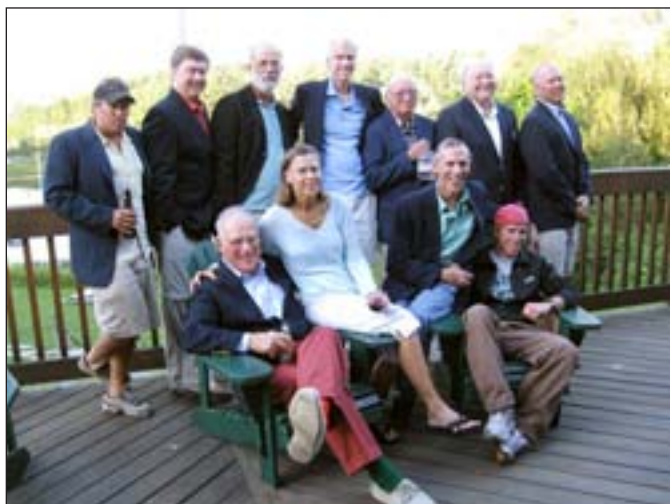
Fleet 332 potluck dinner

2008 was the year in which our backwoods Lightning Fleet showed signs of achieving an unprecedented level of respectability. As the accompanying photo shows, we celebrated this trend at our annual dinner when several of our skippers sported a very classy assortment of genuine yachting type blue blazers.