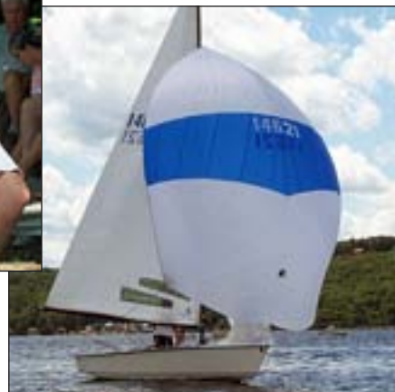
All alone, in front

Our regatta is June 27 and 28 on beautiful Spofford Lake. Come for a trip back to the good times of the summer camps of your younger days.