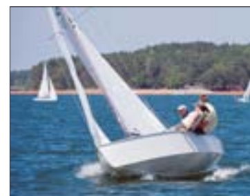
It was a heavy air year