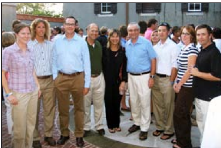
Texas Delegation Lightning NAs 2008: