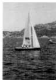
Team Lightning at "Coppa dei Campioni" in Sardinia, July 2002.