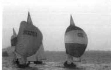
Sailing in Chongon damn at sunset. Great conditions and fresh water!

Aquí corrimos prácticamente saltando un fin de semana desde Julio hasta finales de Octubre. Las parrilladas estuvieron a la orden del día y ni que decir de los ronchitos al final de la tarde.