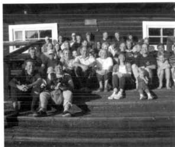
A "family portrait" after the Jyväskylä Ranking Regatta and Sauna

Some of our members took part in the Keitele Regatta and Päijännepurjehdus which are more or less long distance races.