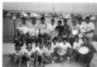
8 teams sailed the 2002 Pacific Cup.

Finalmente en diciembre se organizó la 1ra. Copa del Pacifico Juvenil, campeonato que tiene por finalidad promover la navegación en un Lightning a tripulaciones juveniles, esperamos para el próximo año contar con mas países y mas tripulaciones.