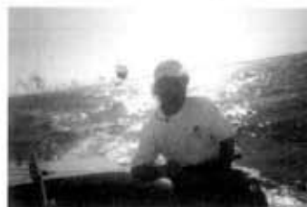
Southern Circuit 2001. A nice view of the fleet!