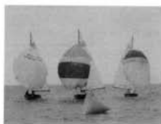
A nice and tight leeward rounding at the Pacific Cup.