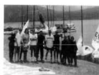
The team from Salinas at the Nationals in San Pablo.