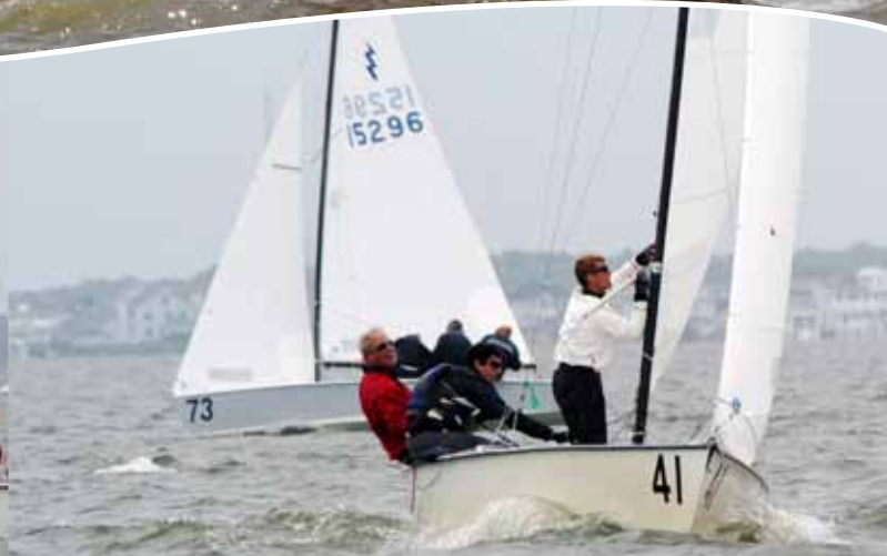
Spole and Warren Teams