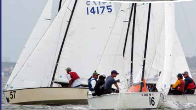
Duffy and Buckles Teams