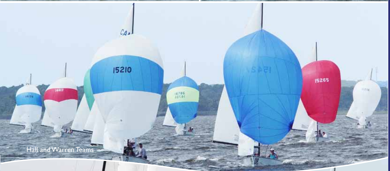
Hall and Warren Teams