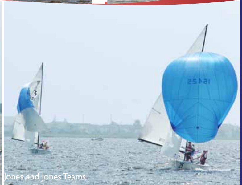
Jones and Jones Teams