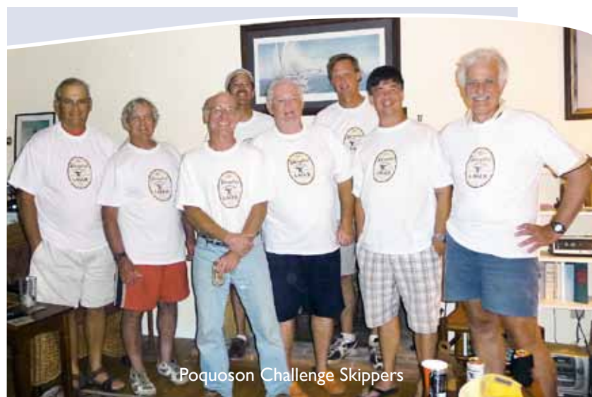
Poquoson Challenge Skippers