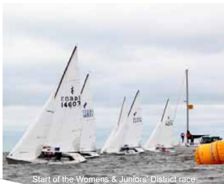
Start of the Womens & Juniors' District race