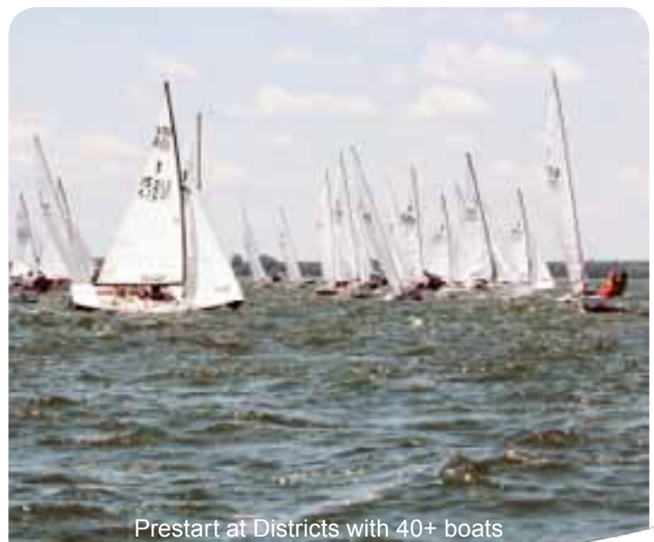
Prestart at Districts with 40+ boats

Our mission, if we cared to accept it, was to bring back the good old days of big fleets and fun regattas for which our club had been known. In the past fifteen years we have seen numbers decline everywhere and wanted to take a shot at putting some life back into our event. "How the hell are we going to do that?" was asked a number of times, but our leader was not to be stopped. He first surrounded himself with others he could rely on to help carry the load and recruit more rebels for our cause. Pieces and parts were divided amongst this inner circle, and he began to make the Kool Aid, which we all drank. Luckily, we all woke up—unlike the folks who drank with Jim Jones.