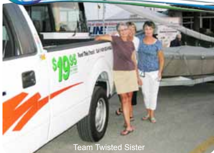
Team Twisted Sister