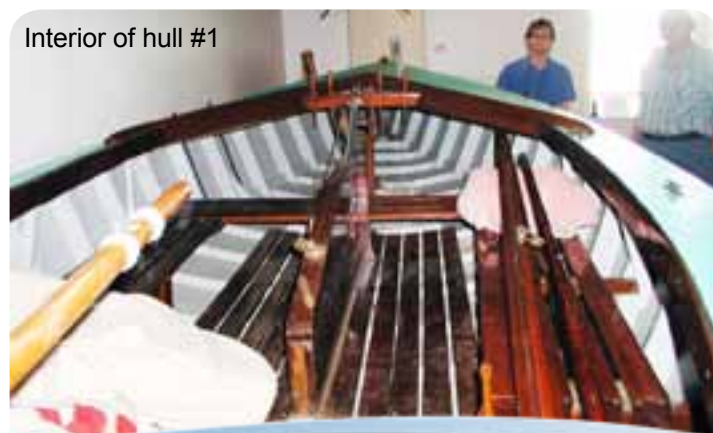
Interior of hull #1

There is no time better than the present to make gifts to our Class. Your contribution will assure that the next generation of sailors will have the same support that we all now enjoy. We hope you will consider planning an ILCA donation, always informed, by appropriate legal and financial counsel.