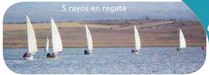
5 rayos en regata