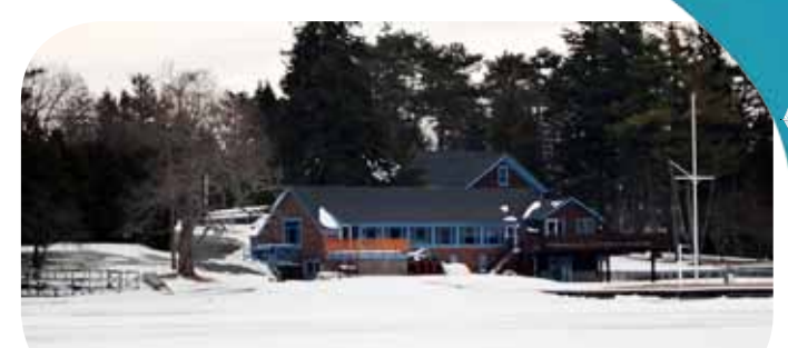
Willowbank in the winter