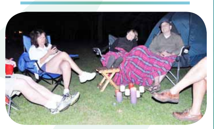
No-burn campfile at every regatta

The CNY District also presents a trophy known as the Blue Jacket. It is based on high point scoring. Each boat receives one point for every boat it beats. Scoring is based on the best three out of four (two-day) regattas. The winners for the 2012 season were: