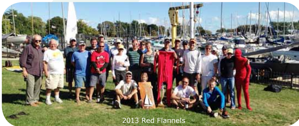
2013 Red Flannels