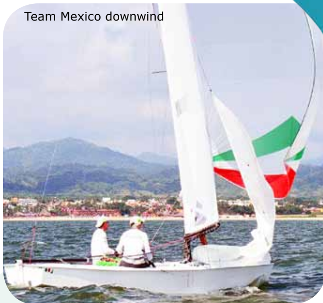
Team Mexico downwind