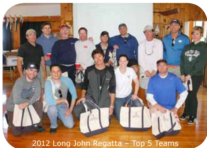
2012 Long John Regatta - Top 5 Teams