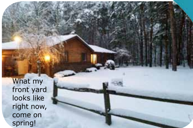
What my front yard looks like right now, come on spring!

2014 Season is around the corner, thank goodness, as I have had enough of this white sh!t on the ground and the cold temps. 2014 will bring with it a District Championship at Boyne City on Lake Charlevoix and the semi-annual return of the Higgins Lake Parrot Flip regatta, a must do on many sailors lists. My toes are cold, my fingers numb and Scars & Scrapes is frozen