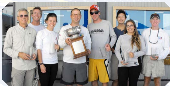
First through third places in the CA Districts.