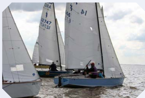
Start in the Río de la Plata

A very demanding schedule has been set for 2015 that includes an annual Grand Prix, which will run on inland lakes and the famous Río de La Plata in Buenos Aires.