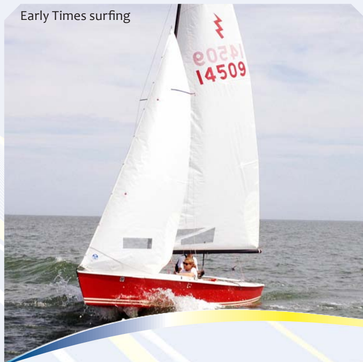
Early Times surfing