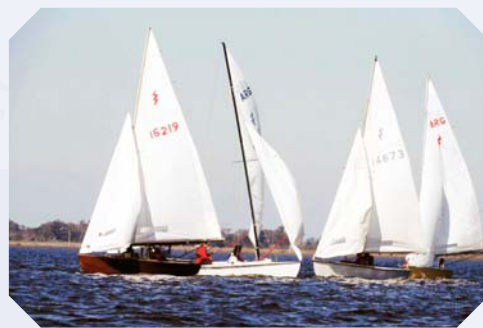
Prestart in the Laguna de La Setúbal Championship