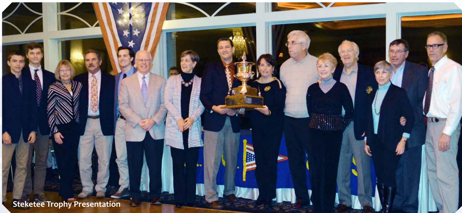
Steketee Trophy Presentation

Finally, the season ended with news that Riverton Fleet was awarded the ILCA's Neal Steketee Trophy in recognition of the Fleet's active Wednesday night racing, hosting of regattas, regatta attendance, and help loading boats into containers to be shipped abroad. Indeed, 2014 was a busy year for Fleet 228.