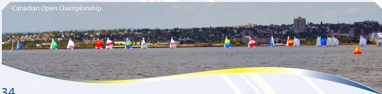
Canadian Open Championship