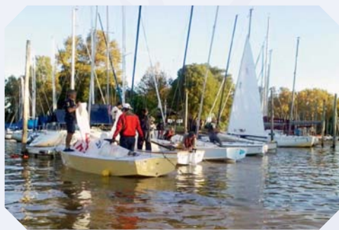
After race in the San Isidro Labrador Championship