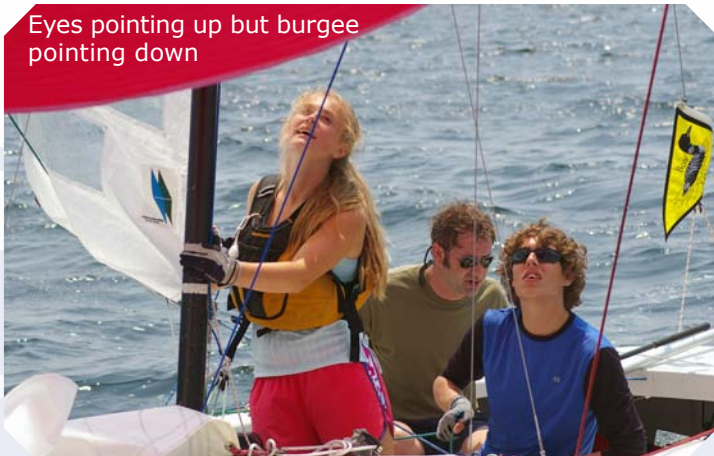
Eyes pointing up but burgee pointing down