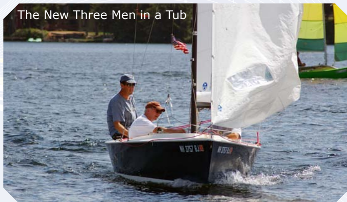
The New Three Men in a Tub

at the end of the season as a replacement and did manage to get her out for a couple of races. Here's hoping she is a steady presence on the race course next year.