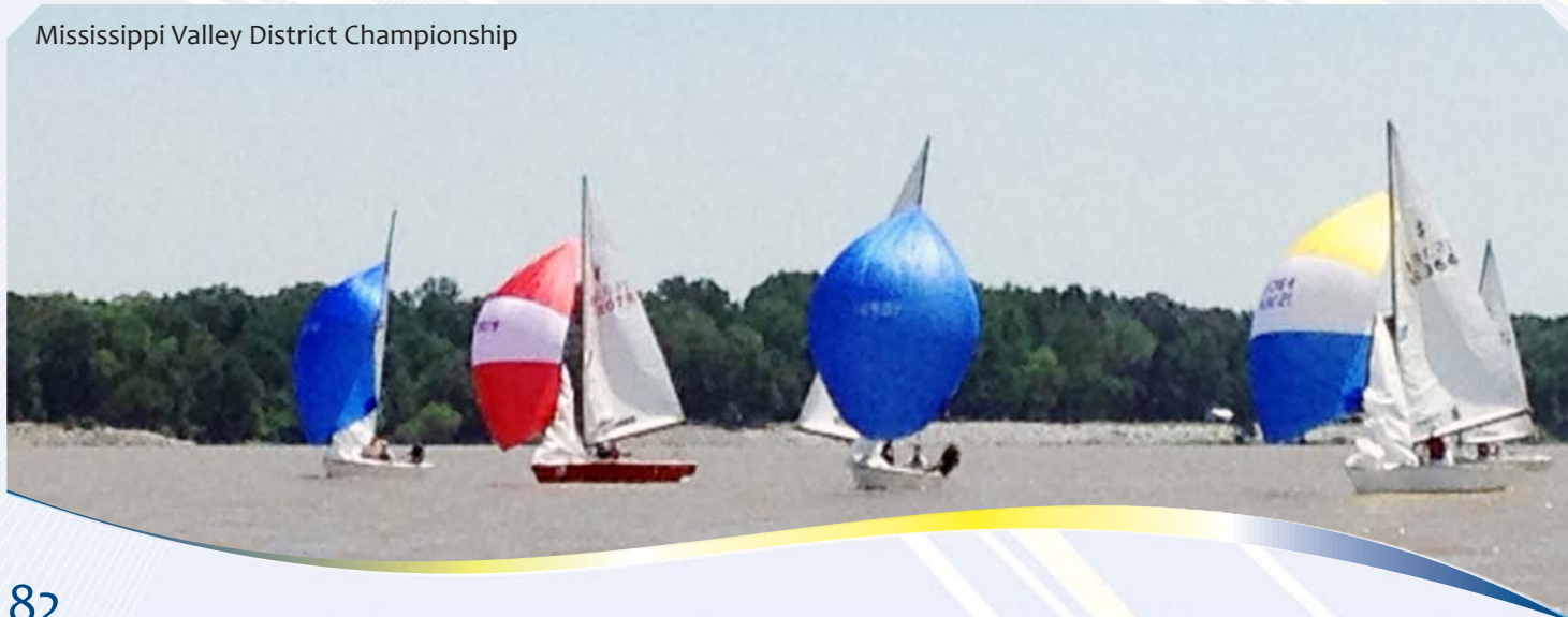
Mississippi Valley District Championship

We are looking forward to a more active year next year. We have a few new crew and a few new sailors looking to sail hard next season. If you are ever in the land of Elvis, please come sail with us on beautiful Arkabutla Lake.