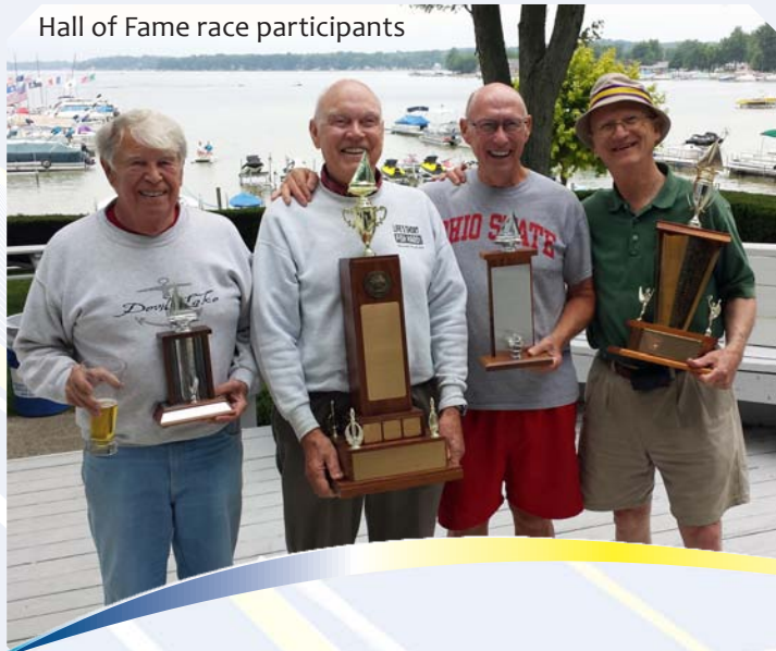
Hall of Fame race participants