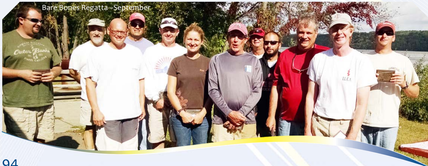
Bare Bones Regatta –September