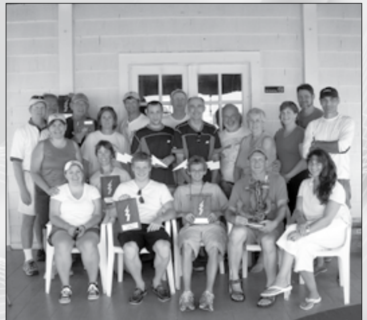
Participants of the '07 Woody Get Together