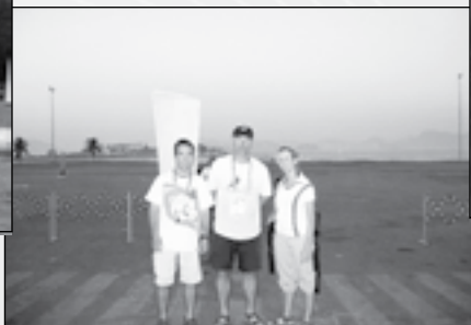
Pan Am games