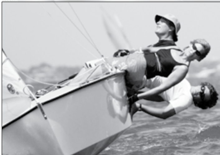
The Menninger family

As of this writing, it is only about 143 days until the summer racing series begins again. See you then.