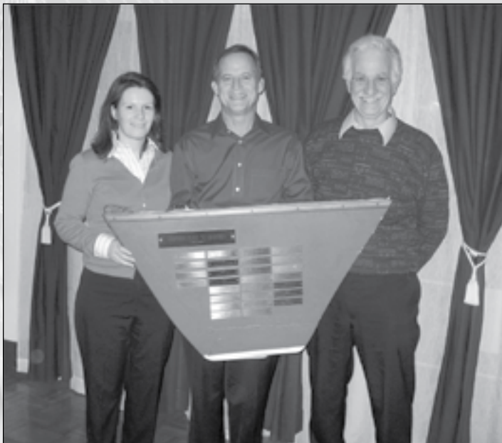
Fleet Champions – Team Windchaser, 14222