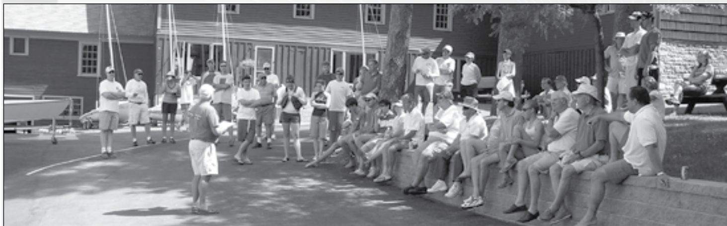
Caz Flash Bash skipper's meeting