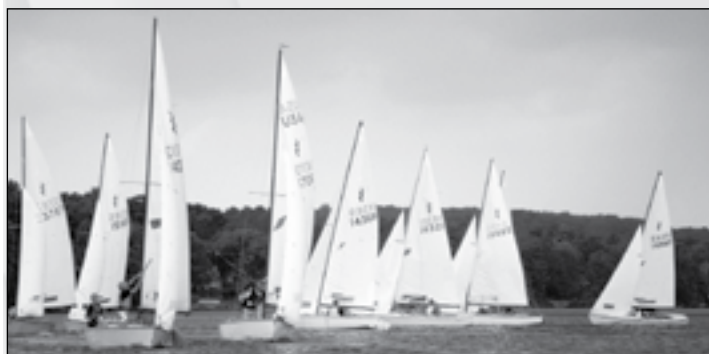
Caz Flash Bash