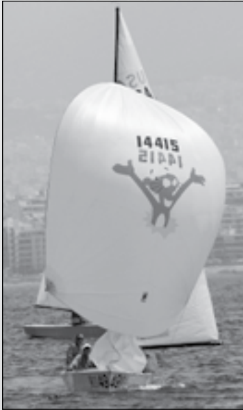
Mr Pinky Sailing Team at the Worlds