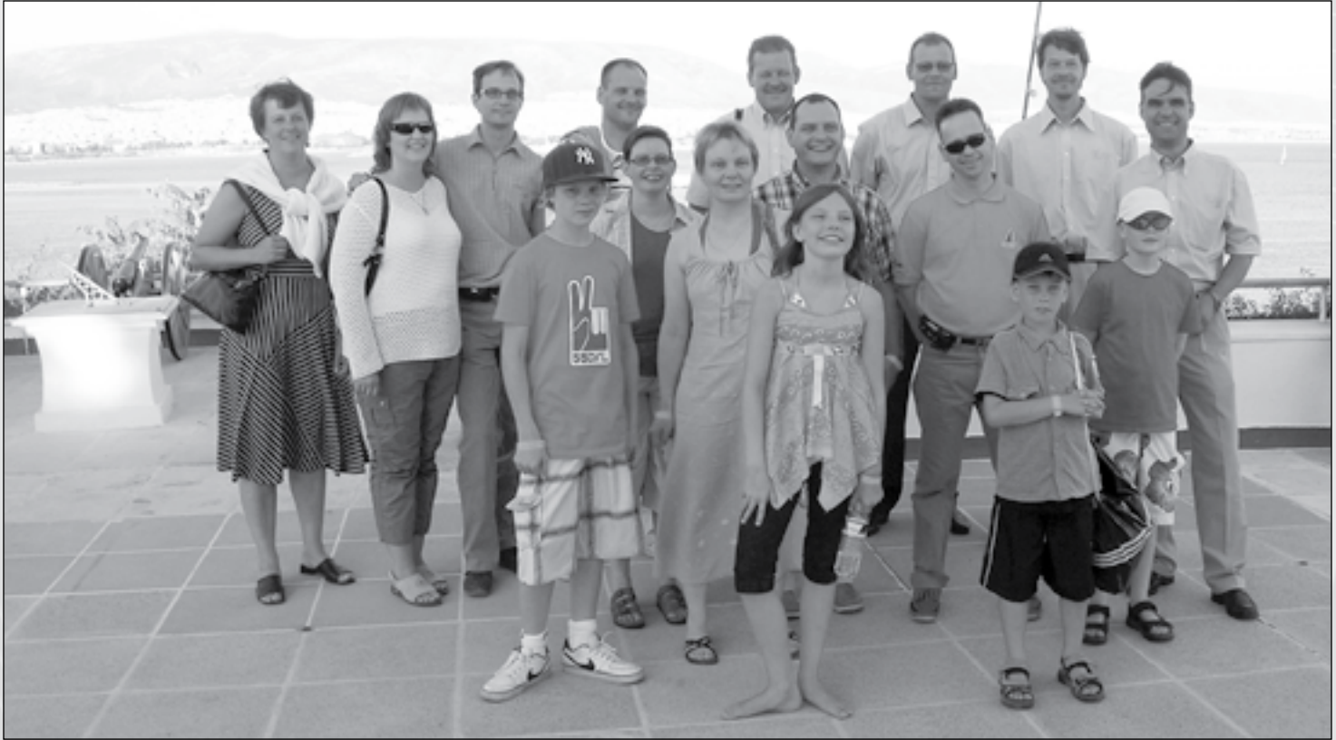
The Finnish Team in Athens 2007

televät britit ja norjalaiset. Toivotamme heidät tervetulleiksi Suomeen purjehtimaan samoin kuin Nigerian kautta litimaaksi nousseen Australiankin edustajat. Tarjolla on ensi kesänä niin avointa ranking-sarjaa, SM:iä, matkakilpailuja kuin puuvenekisaakin. Vuokravene löytyy tarvittaessa.