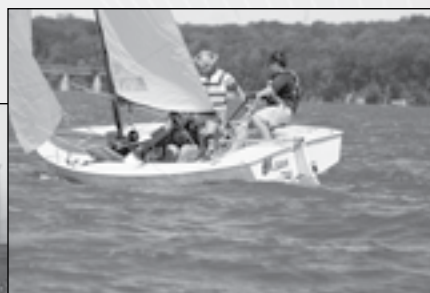
Women's North American Championship

Fleet 279—Temple Reef Sailing Club Sailing on Thunder Bay & Lake Superior Thunder Bay, Ontario, Canada