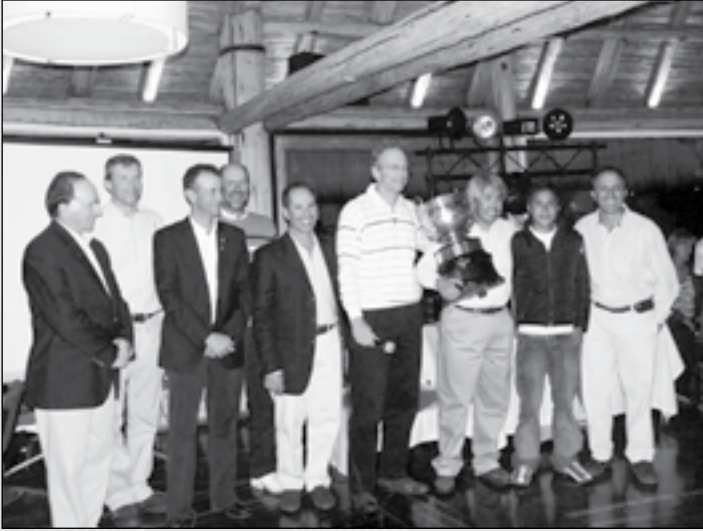
South American Champions